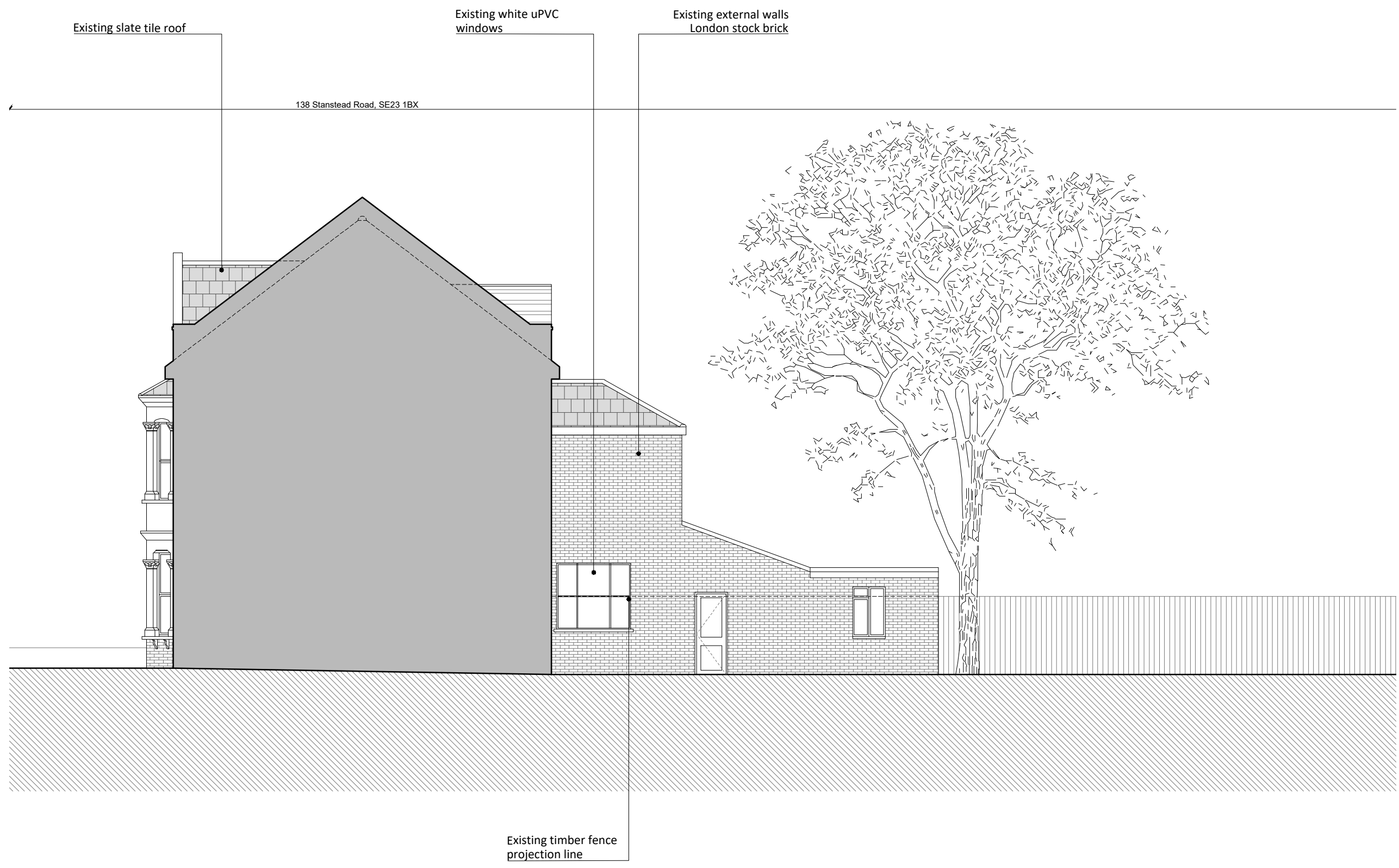
4 EXISTING SIDE ELEVATION (WEST) SCALE: 1:100