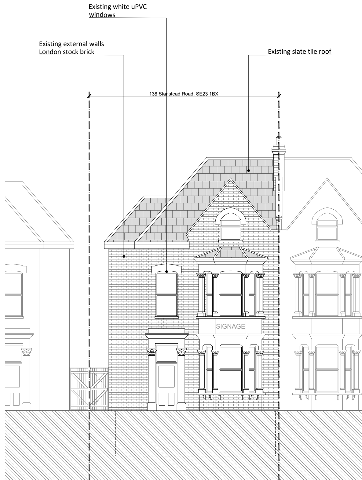
1 PROPOSED STREET ELEVATION SCALE: 1:100