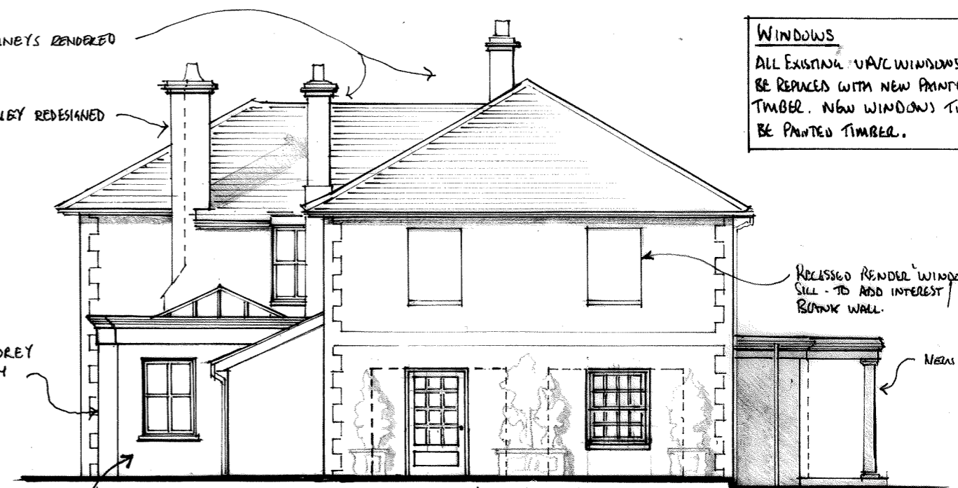
PROPOSED NORTH ELEVATION 1:100

NEW WALLS ARE WHITE PAINTED RENDER TO MATCH THE EXISTING HOUSE