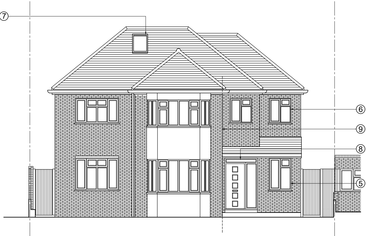
Front Elevation as Proposed