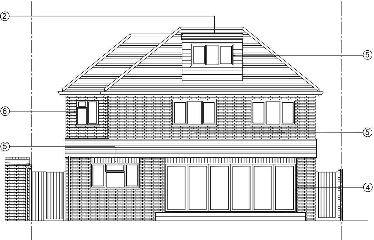
Rear Elevation as Proposed