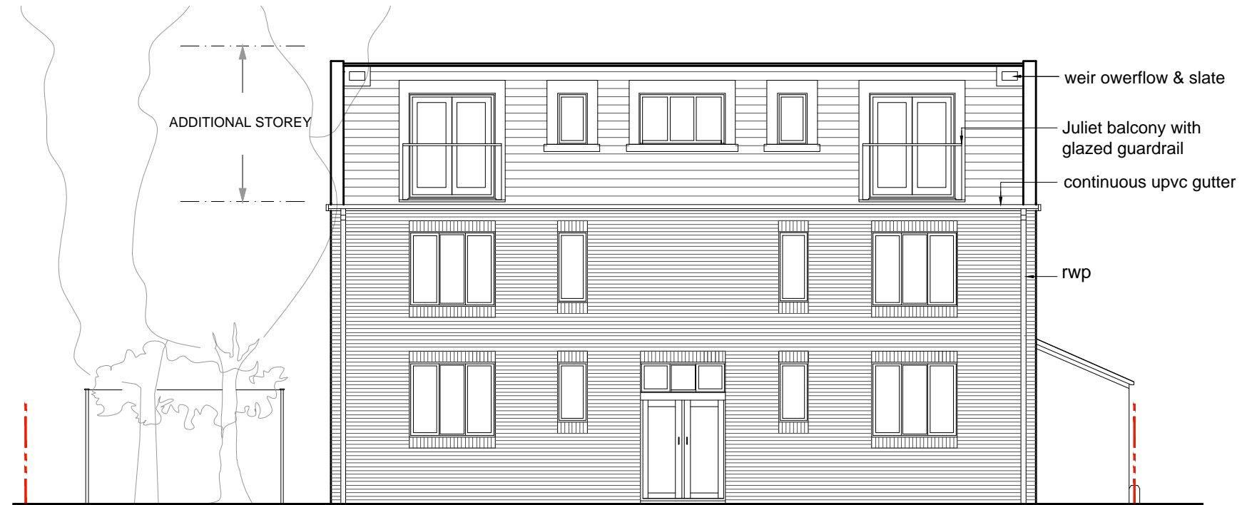
SOUTH-EAST (REAR) ELEVATION

EXTERNAL METARIALS ROOF - ETERNIT FIBRE - CEMENT SLATES WITH DORMER FEATURES WALLS - SELECTED FACING BRICKS WITH BRICK SOLDIER COURSE HEADERS, SILLS AND BANDING TO MATCH EXISTING RAINWATER GOODS - BLACK UPVC GUTTERS & DOWNPIPES