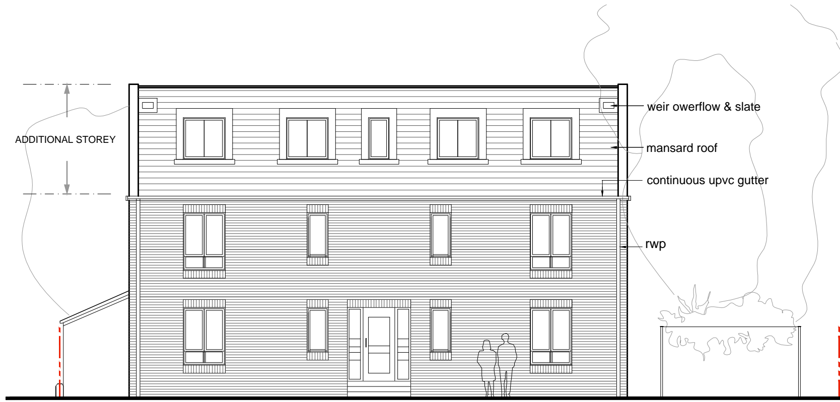
NORTH-WEST (FRONT) ELEVATION

EXTERNAL METARIALS ROOF - ETERNIT FIBRE - CEMENT SLATES WITH DORMER FEATURES WALLS - SELECTED FACING BRICKS WITH BRICK SOLDIER COURSE HEADERS, SILLS AND BANDING TO MATCH EXISTING RAINWATER GOODS - BLACK UPVC GUTTERS & DOWNPIPES