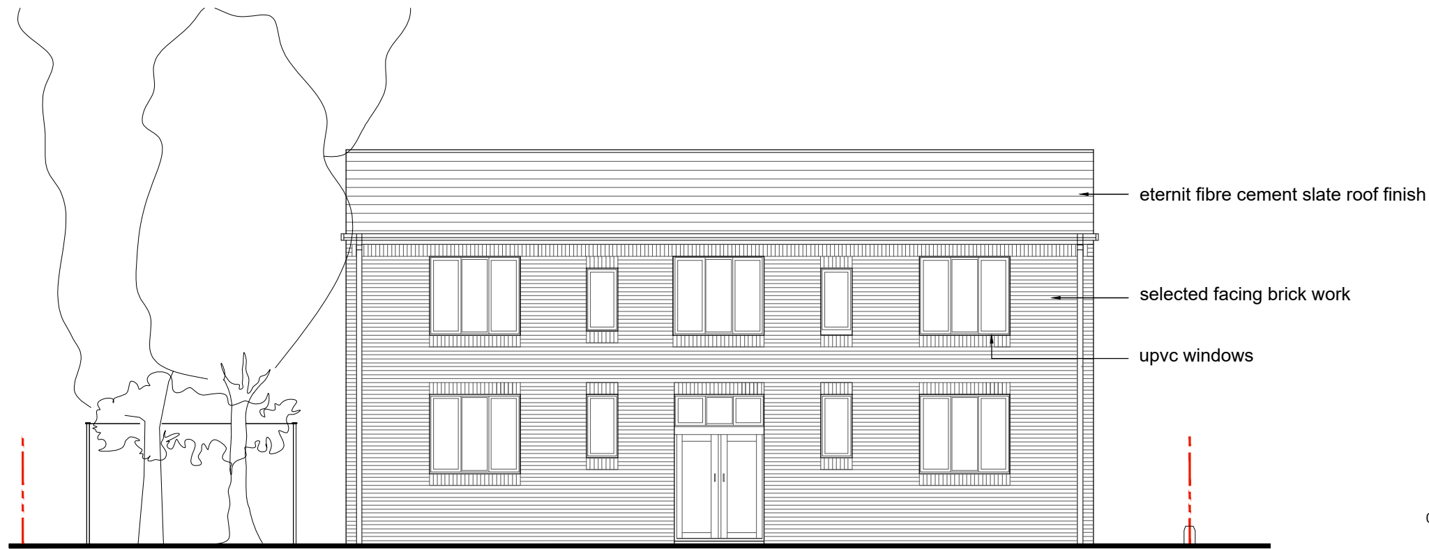
SOUTH-EAST (REAR) ELEVATION