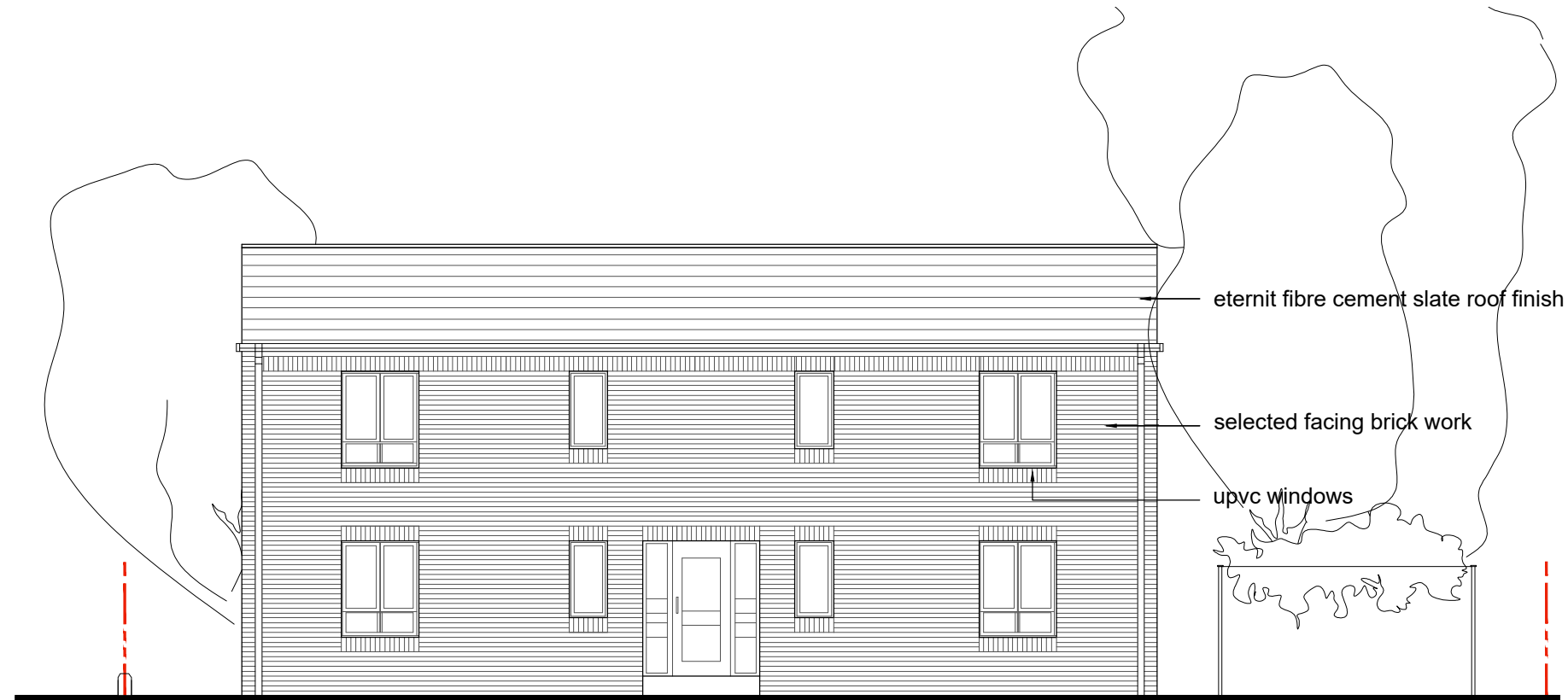
NORTH-WEST (FRONT) ELEVATION