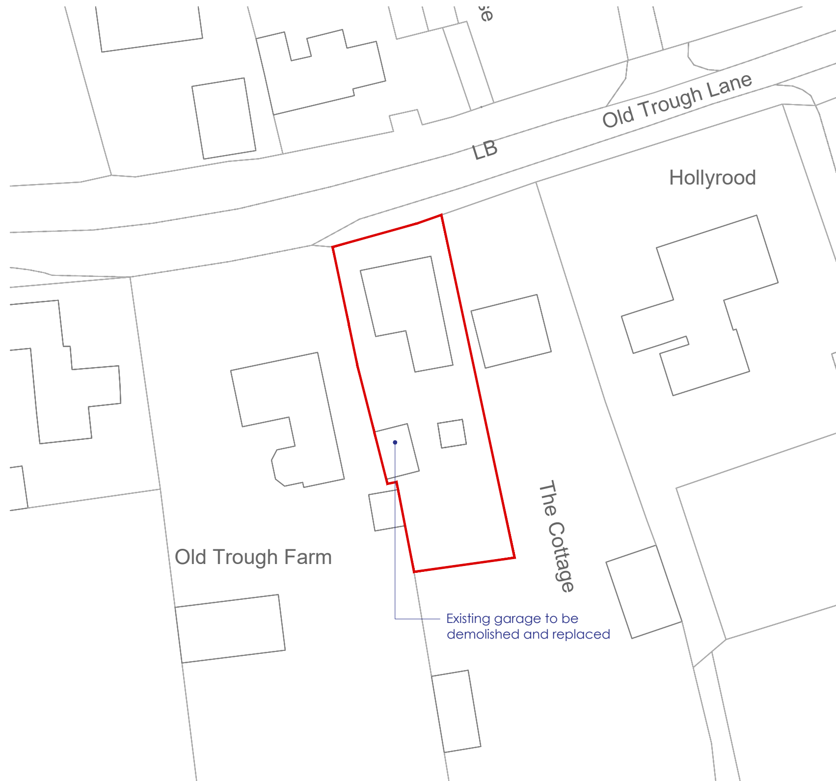
Site Block Plan - 1:500