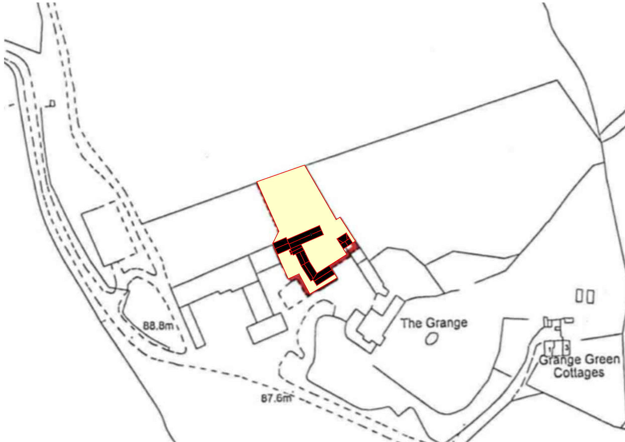
Location Map Scale: 1:1250