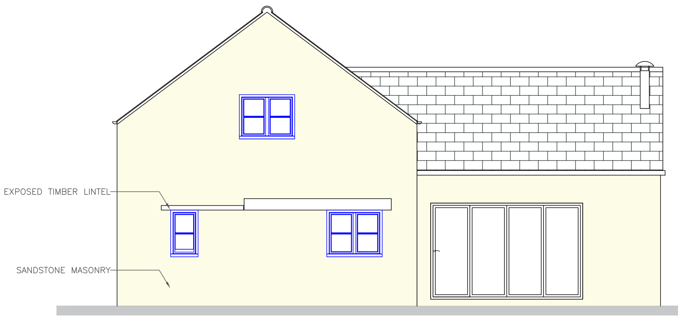
03 WEST ELEVATION AS PROPOSED SCALE: 1:50