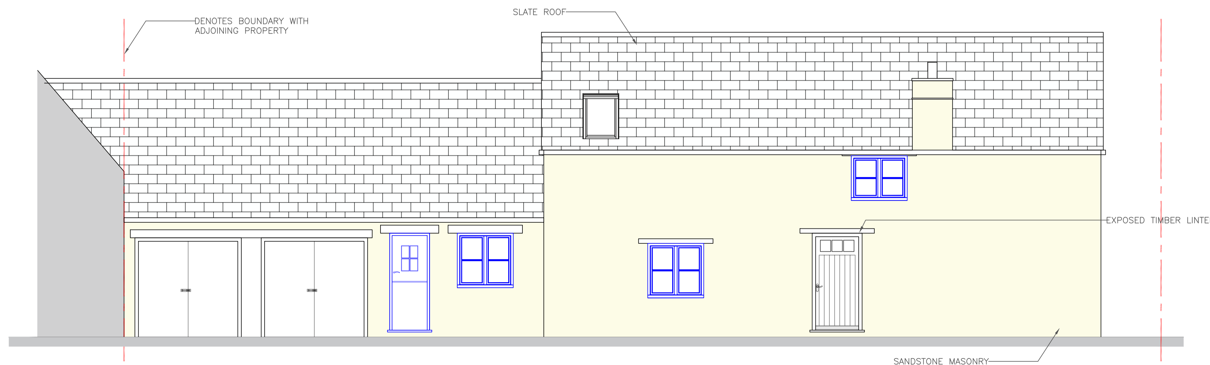
01 NORTH ELEVATION AS PROPOSED SCALE: 1:50