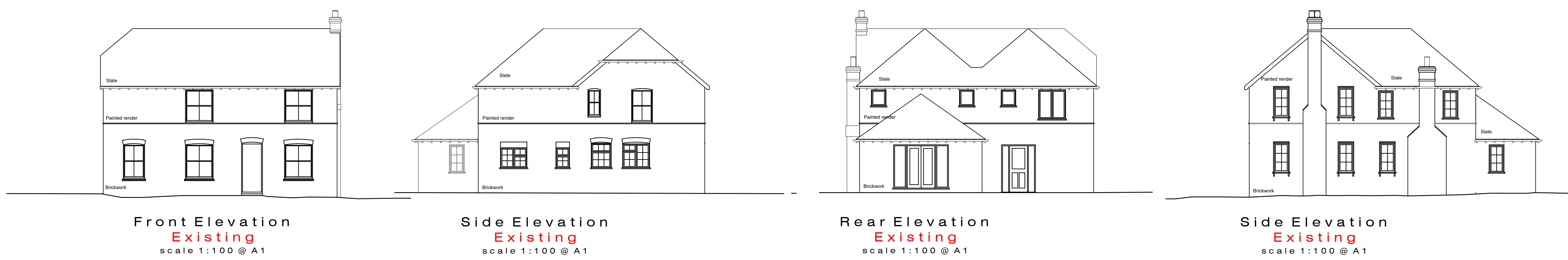
Front Elevation Existing scale 1:100 @ A1