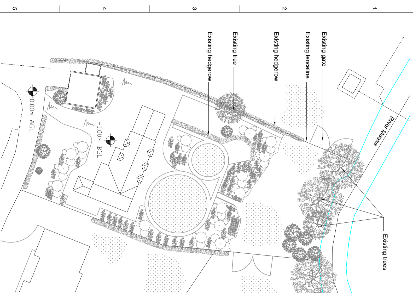
1 Existing Site Layout 1 : 500