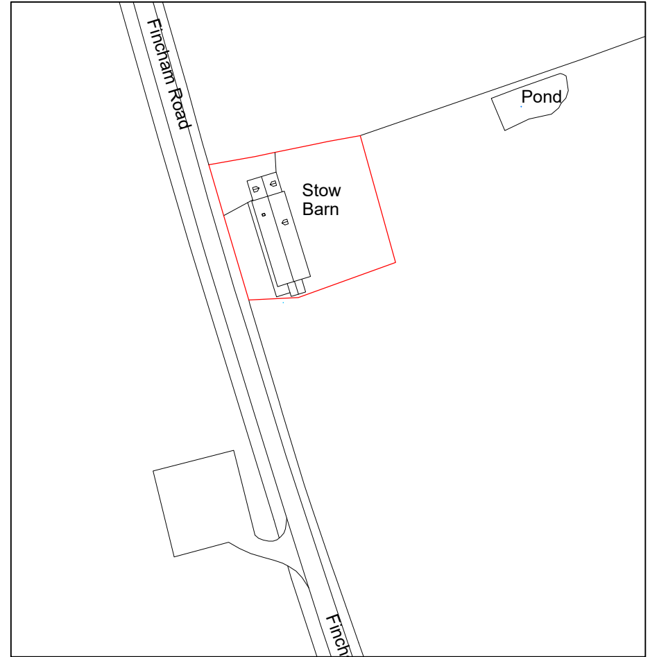
Site Location Plan 1:1250