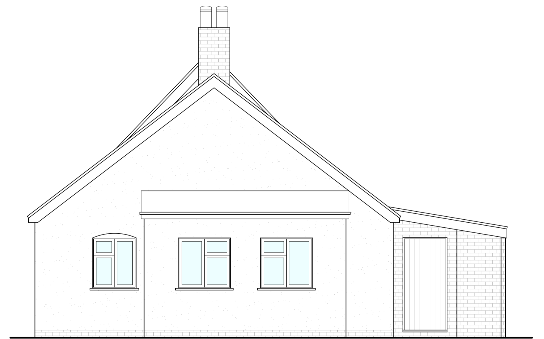
Existing Side Elevation 1:50