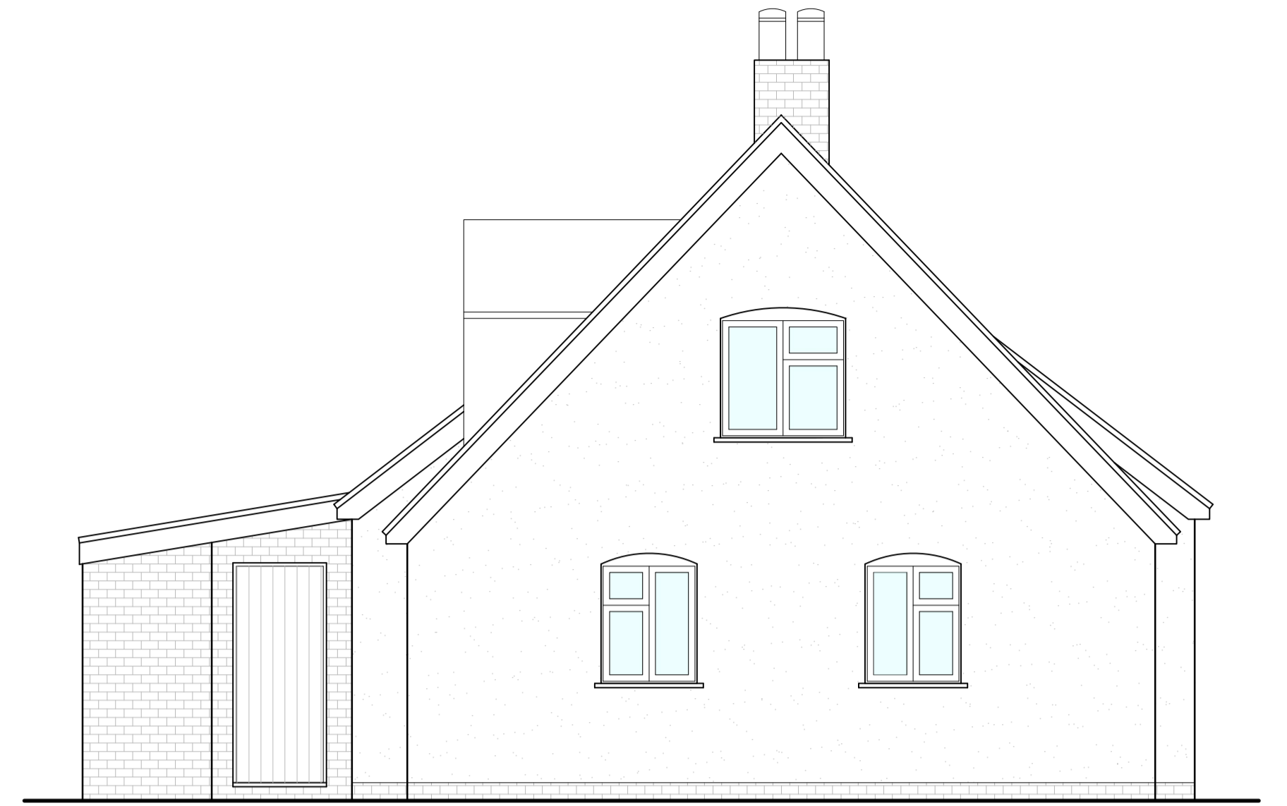
Existing Side Elevation 1:50