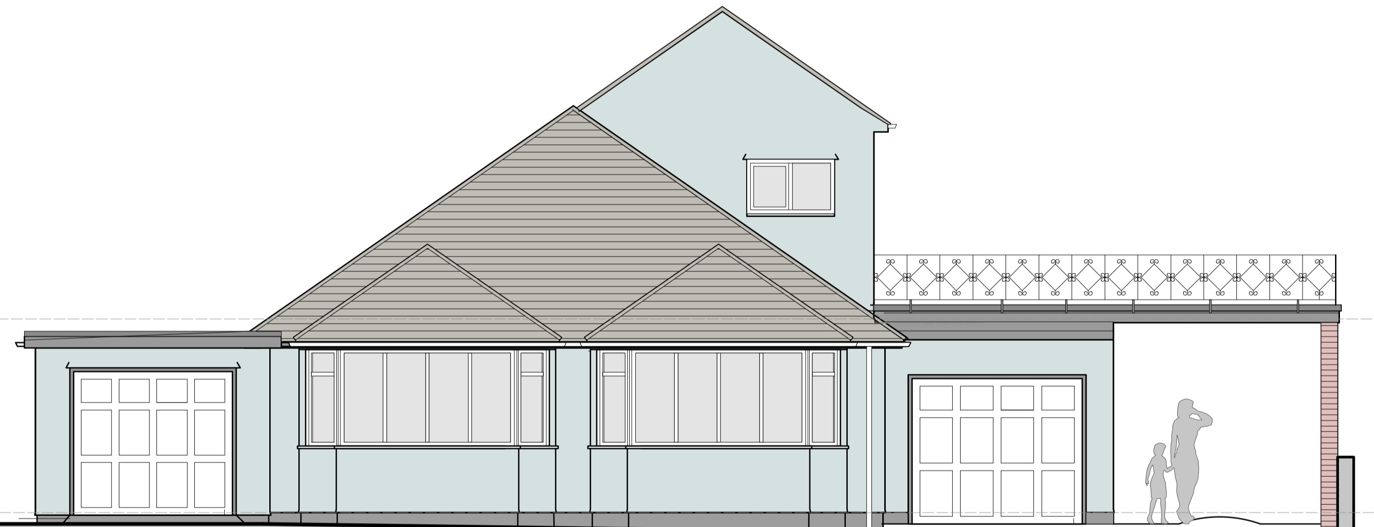
EXISTING EAST ELEVATION (PRINCIPAL FRONT ELEVATION)