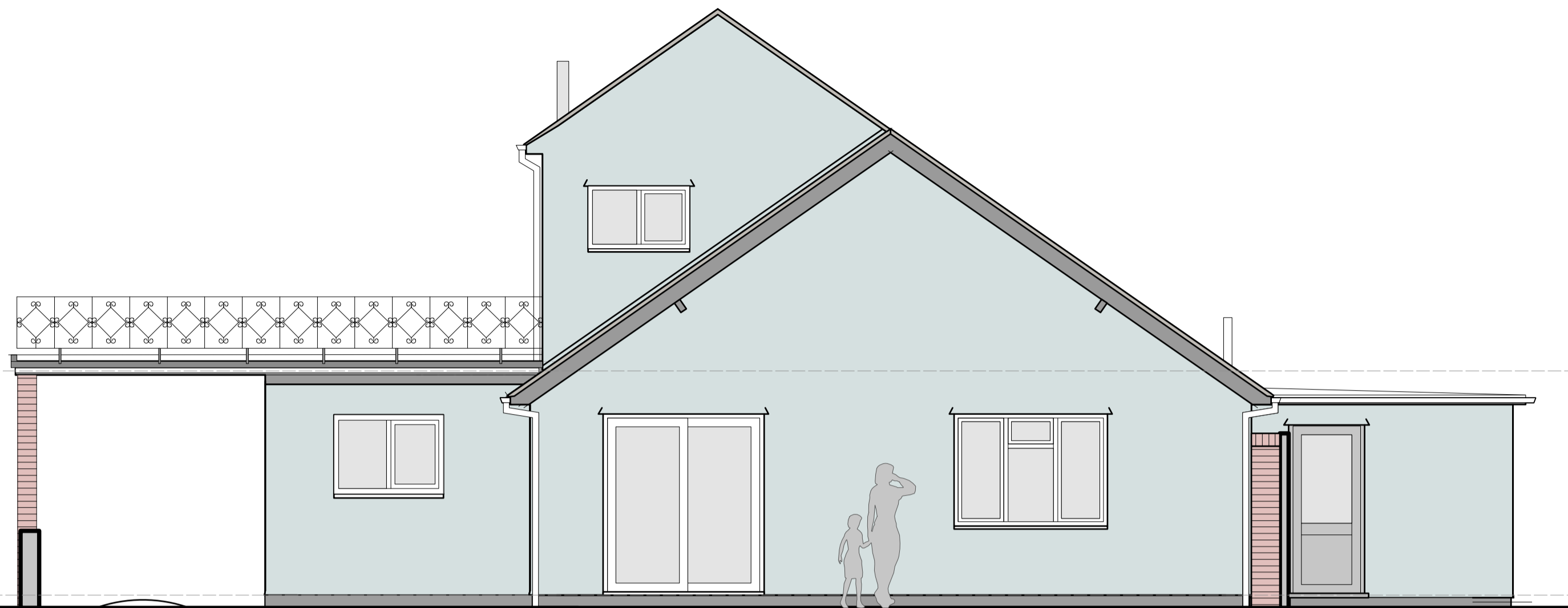
EXISTING WEST ELEVATION (REAR)

General Notes 1. Do not scale this drawing. All dimensions to be as noted. Contractor to check all dimensions on site before carry out works. 2. This drawing is for the private and confidential use of the client for whom it was undertaken and it should not be reproduced in whole or in part or relied upon by third parties for any use without the express written authority of Beech Architects Limited.