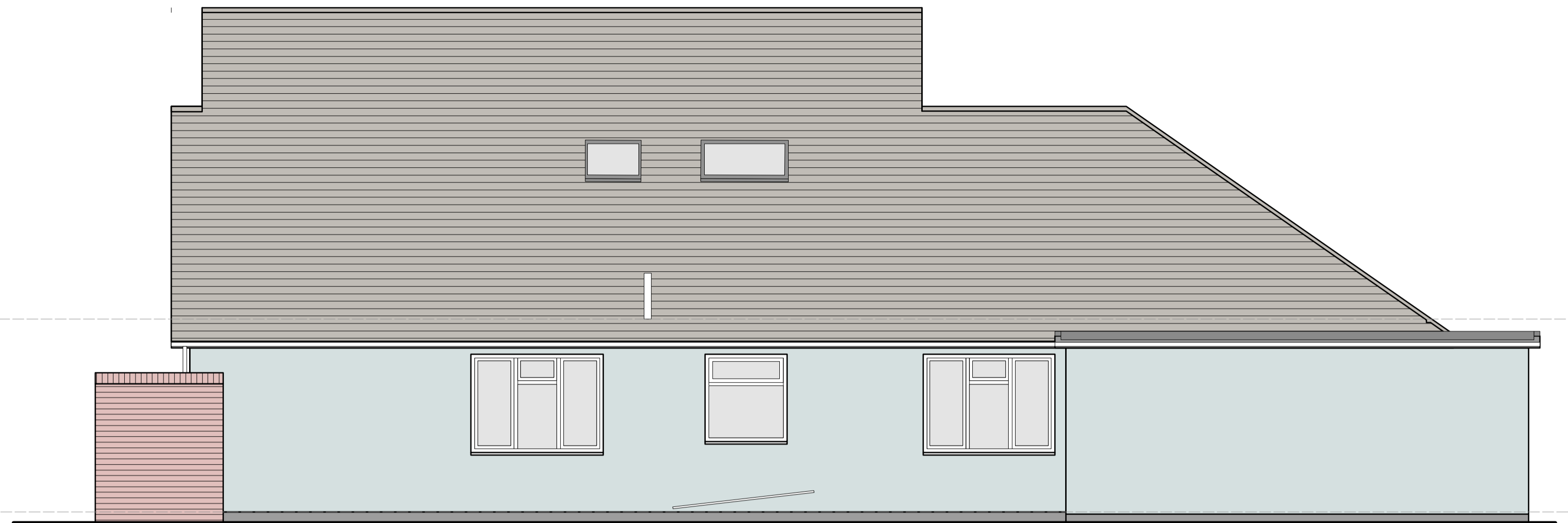
EXISTING SOUTH ELEVATION (SIDE)