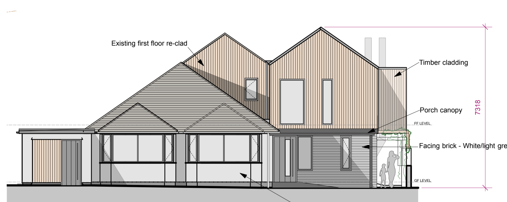
EAST ELEVATION (FRONT)

Insulated render system applied to existing house White/Light grey finish Replacement windows & doors