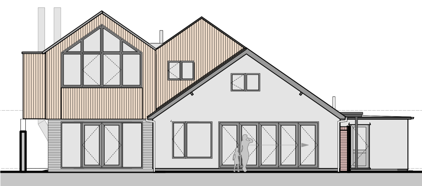
WEST ELEVATION (REAR)

1.8m existing car port boundary wall (extended at east) Timber pergola elements above