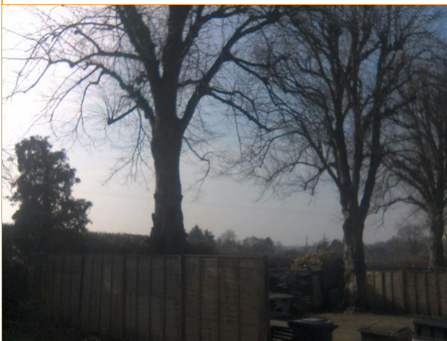
T3 - Lime