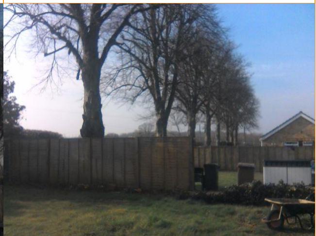
T3 - Lime & distant view