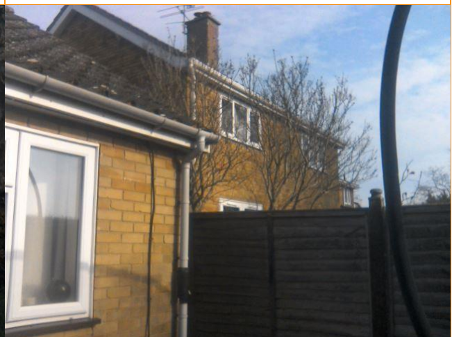
S1 - Lilac mid view