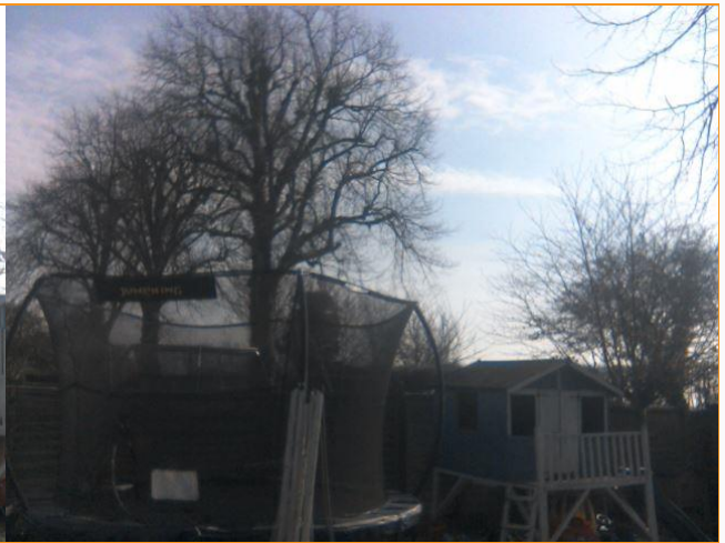
T4 - Lime & distant view