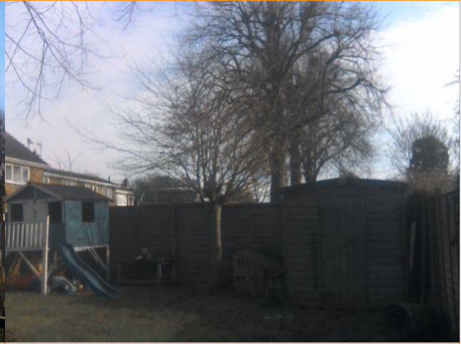
T2 - Beech mid view