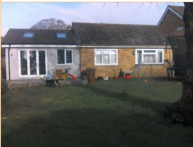
Property rear elevation