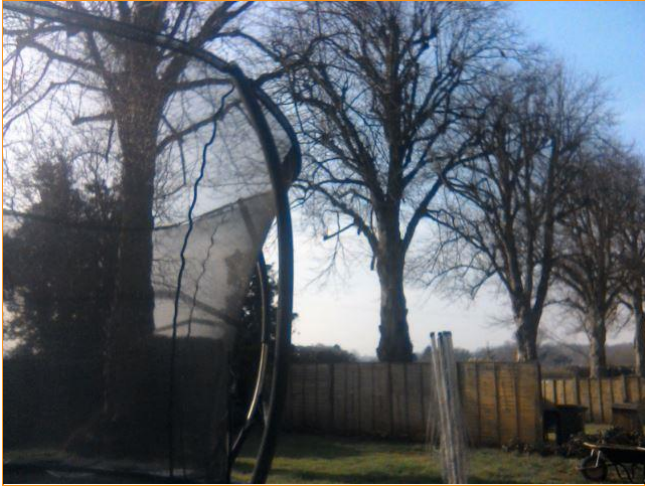
T1 - Lime on left