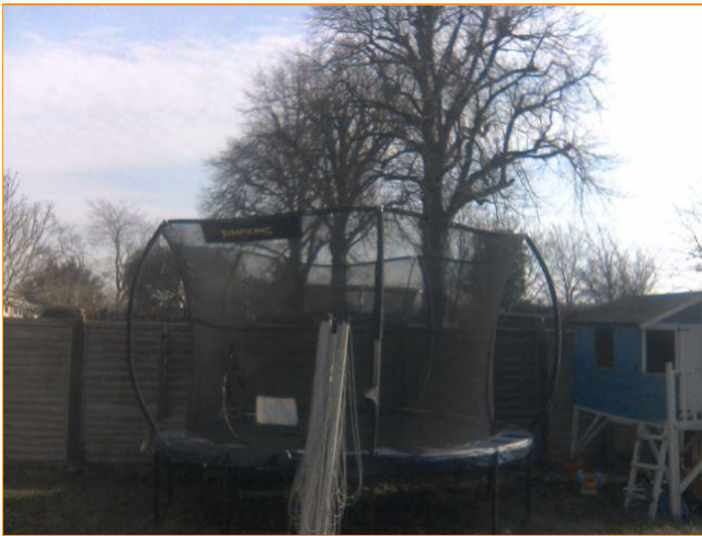
T4 - Lime and distant view