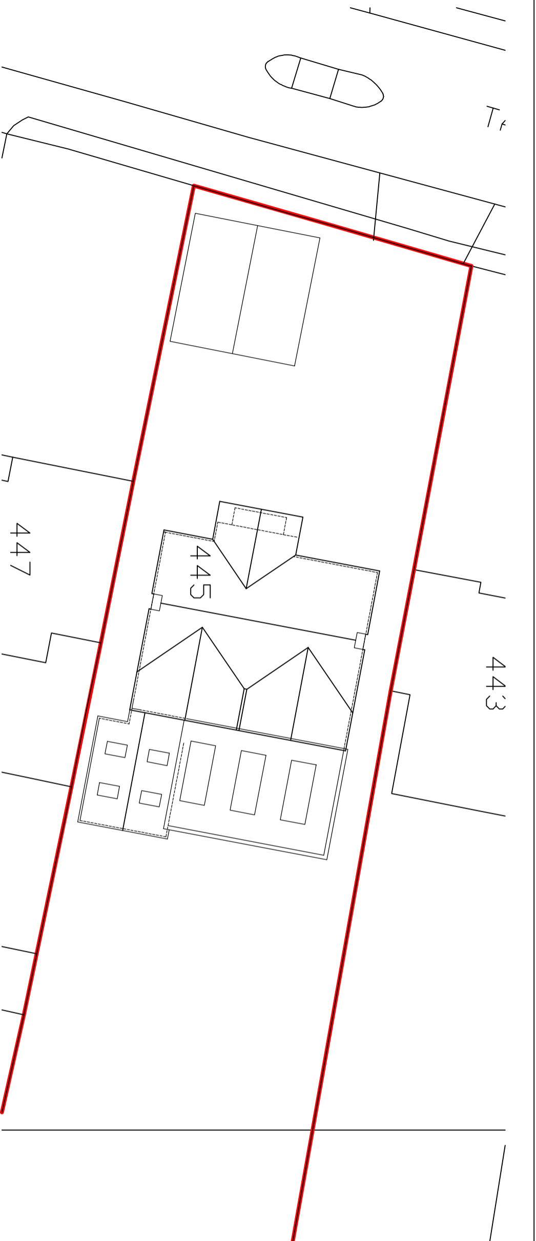
Site Plan 1:200