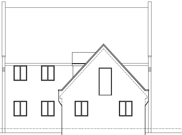
EXISTING NORTH ELEVATION 1-100