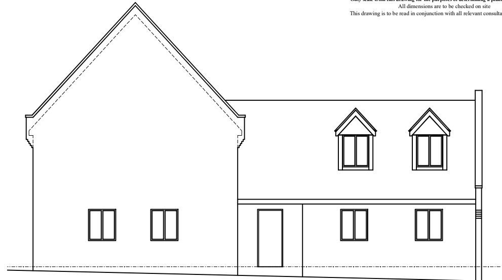
EXISTING EAST ELEVATION 1-100