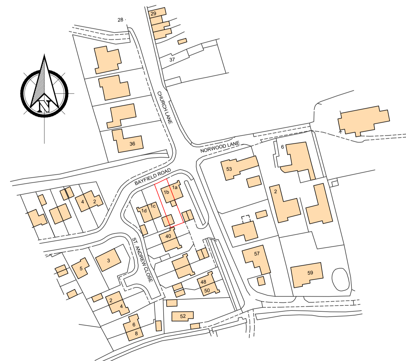
Site Location Plan (scale 1:1250)