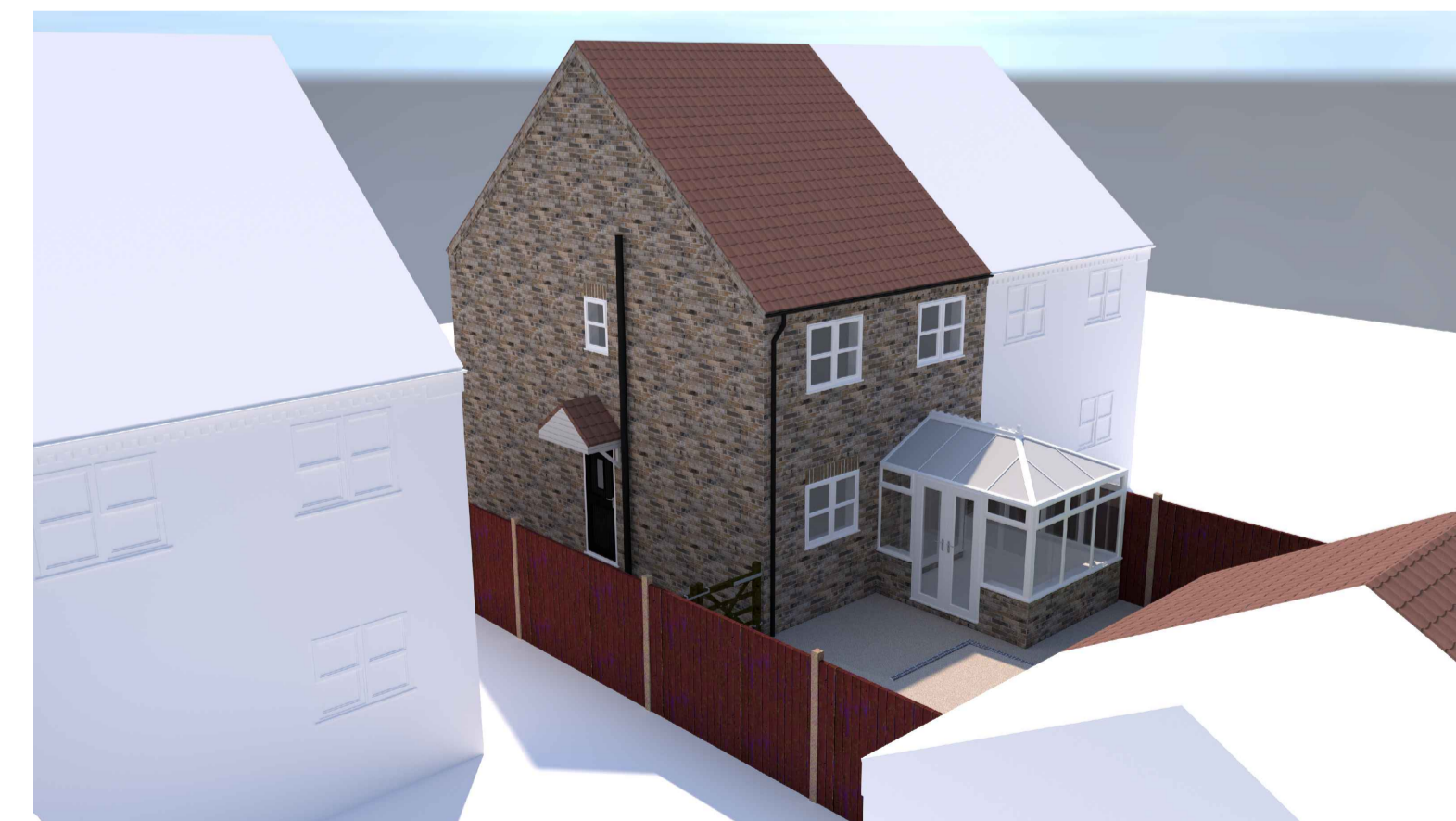
Existing Visuals (n.t.s)