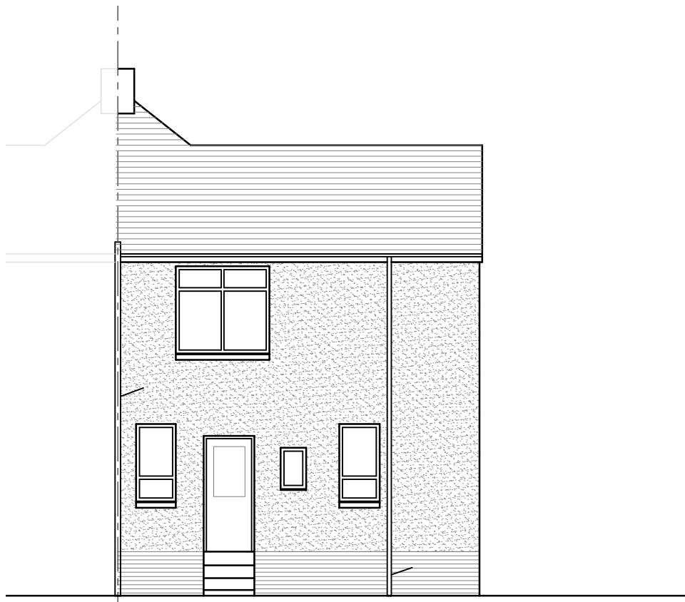
Rear Elevation As Existing