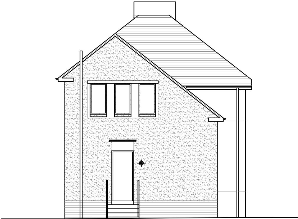
Gable Elevation As Existing