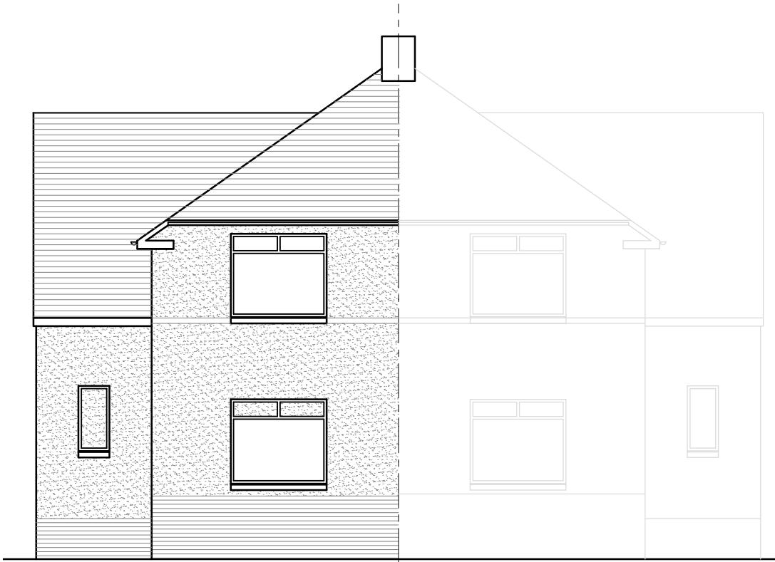
Front Elevation As Existing