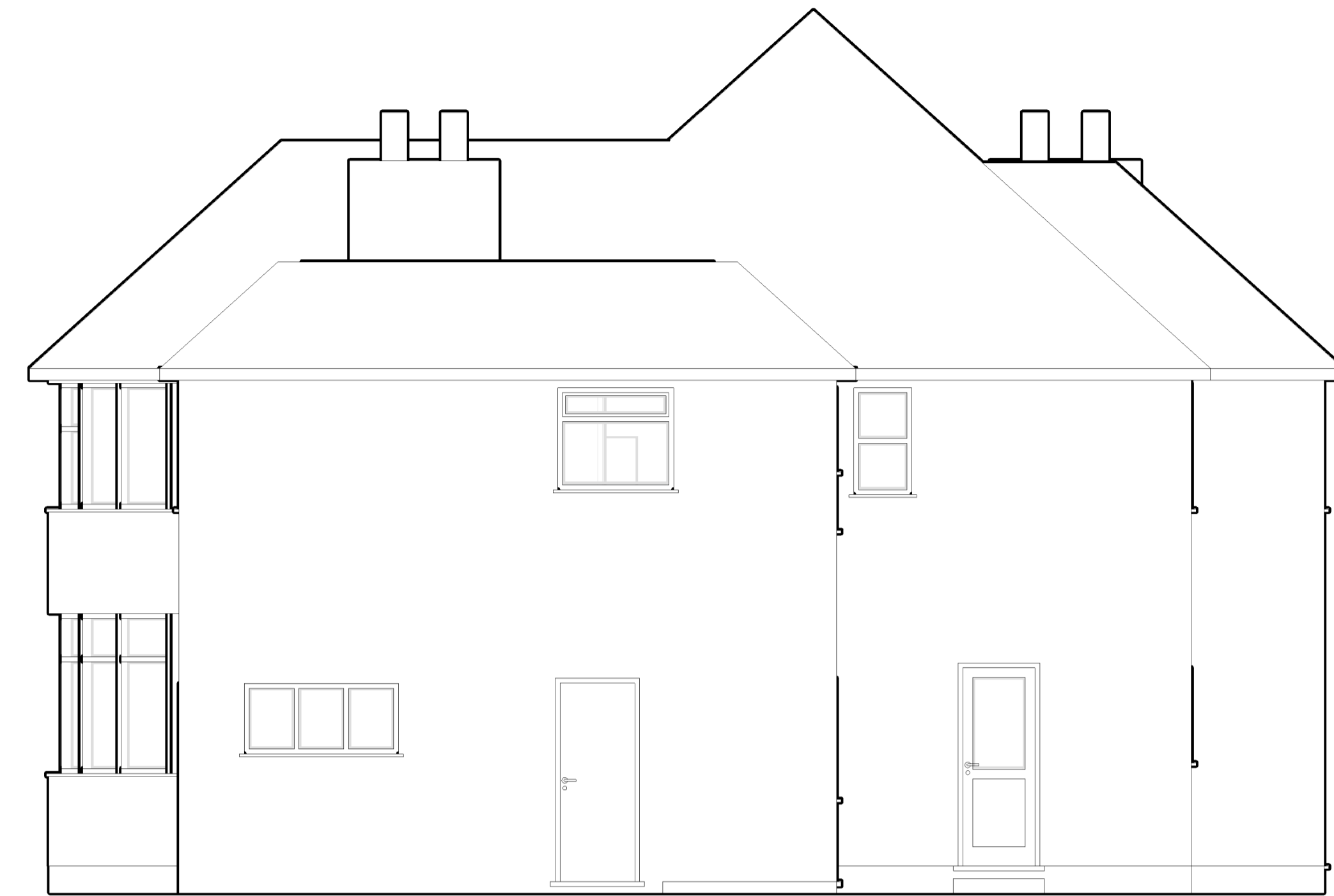
EXISTING RIGHT ELEVATION