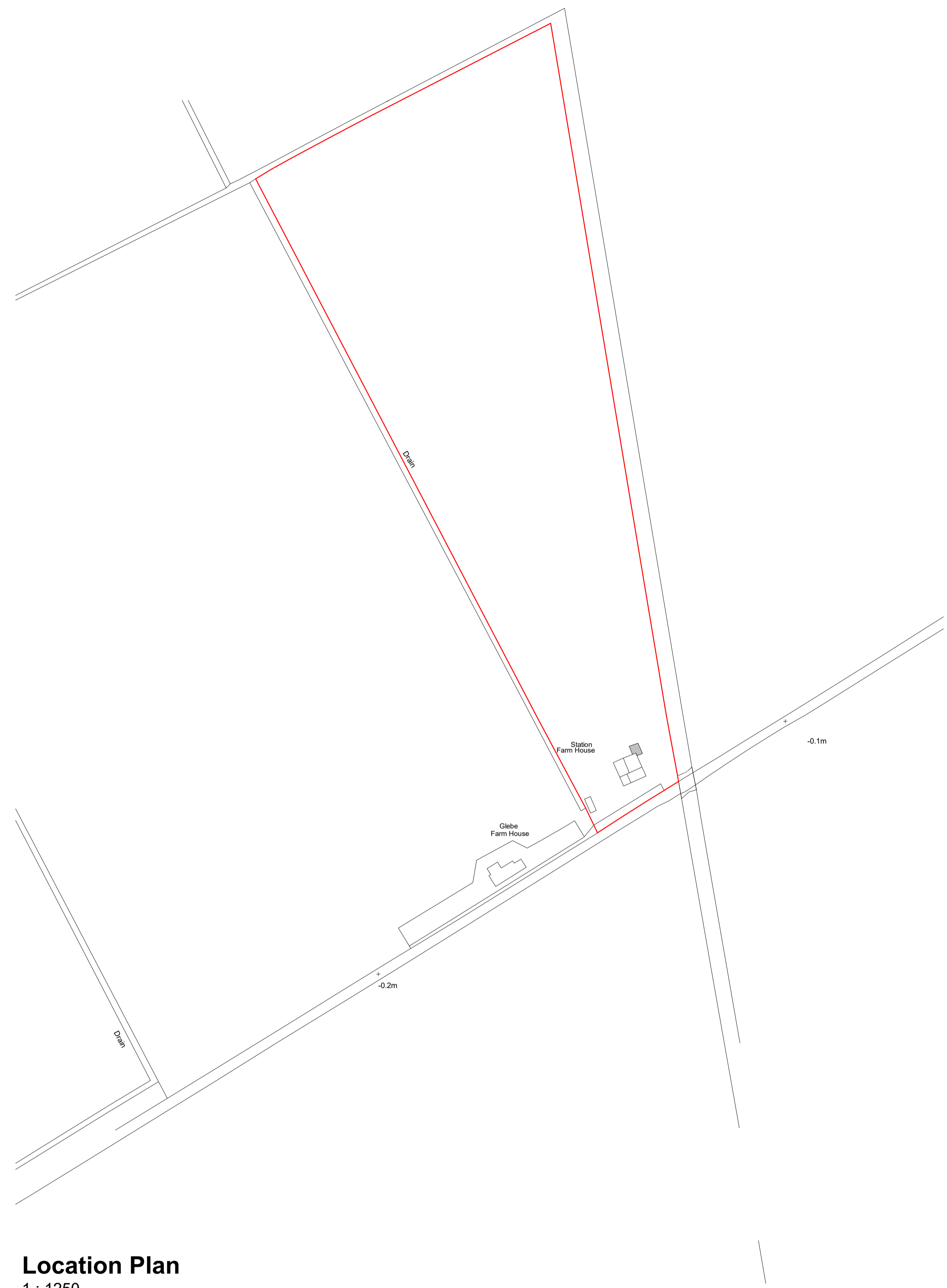
Location Plan 1 : 1250

Project Status Suite 1/C, Warren House, 16-20 Main Road, Hooking, Essex SS8 4DS Telephone: +44 (0)1702 887985 Website: www.designspec.co.uk House - Design Spec Ltd Facebook - Design Spec Ltd Twitter - @Design_Spec_Ltd Instagram - designspec_ltd LinkedIn - Design Spec Ltd