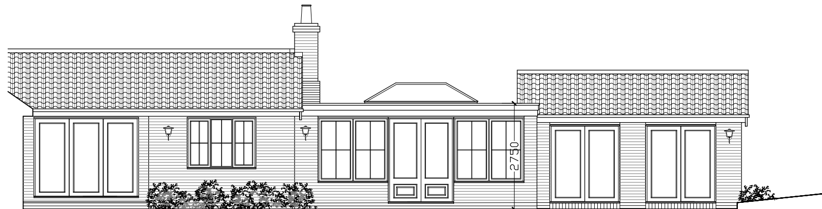
PART PROPOSED SOUTH ELEVATION