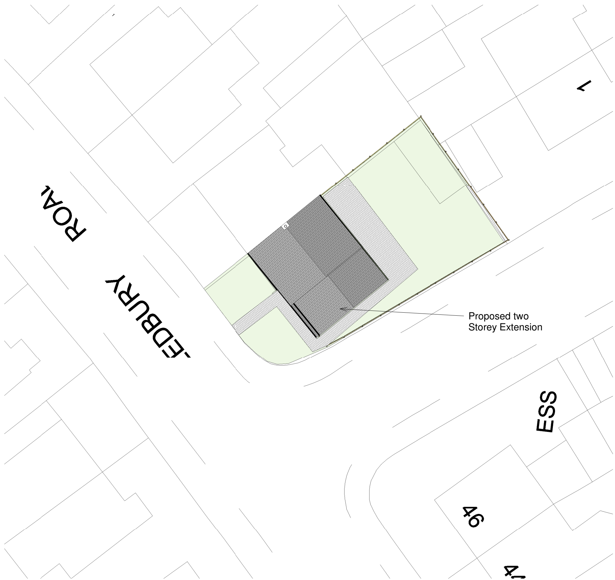
Site Proposed 1 : 200