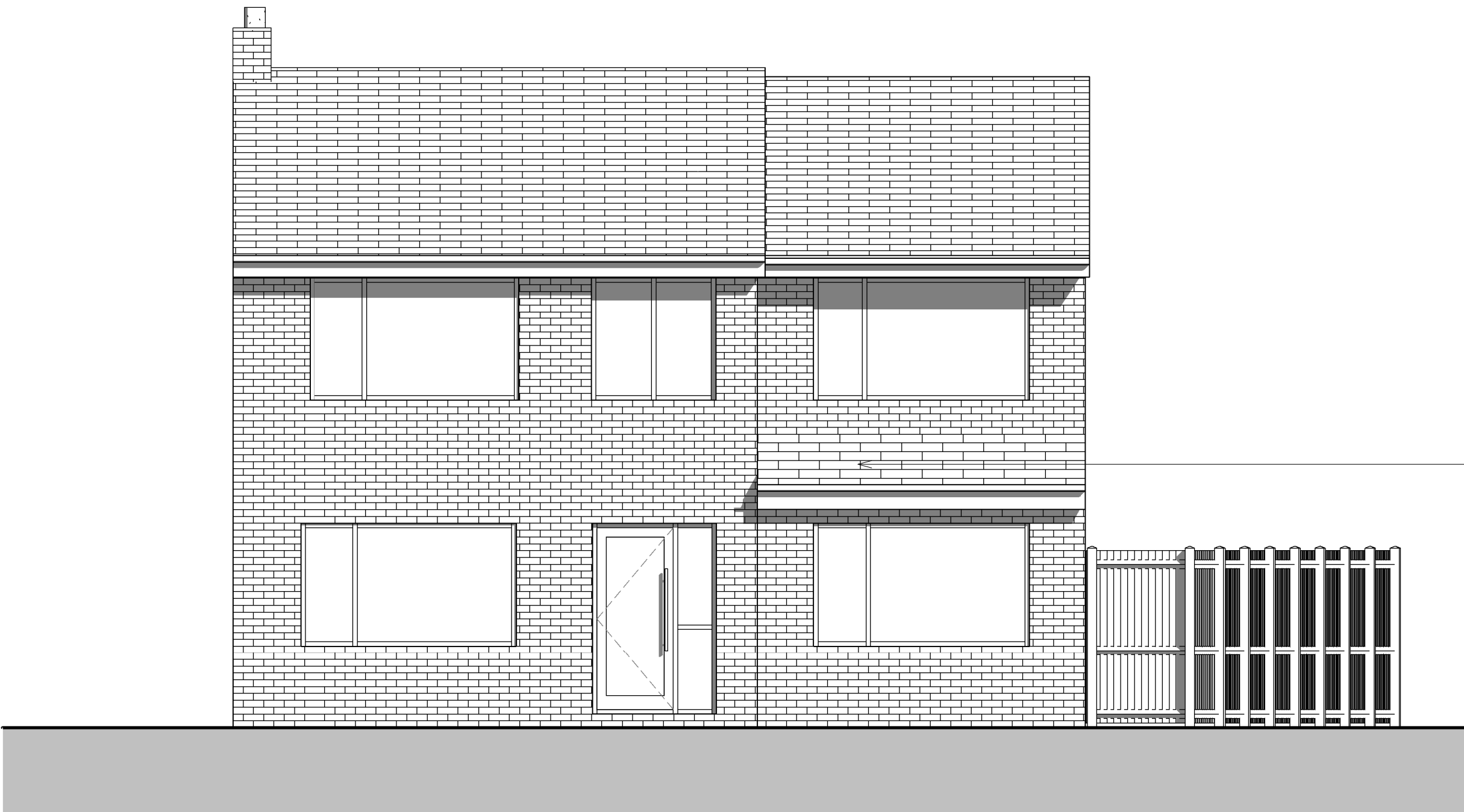
Front Proposed 1 : 50

MATERIALS NEW BRICKWORK - TO MATCH EXISTING. ROOF - CLAY TILES TO MATCH EXISTING WINDOWS - WHITE PVCu DOUBLE GLAZED FASCIAS - WHITE PVCu RWP's & GUTTERS - BLACK PVCu