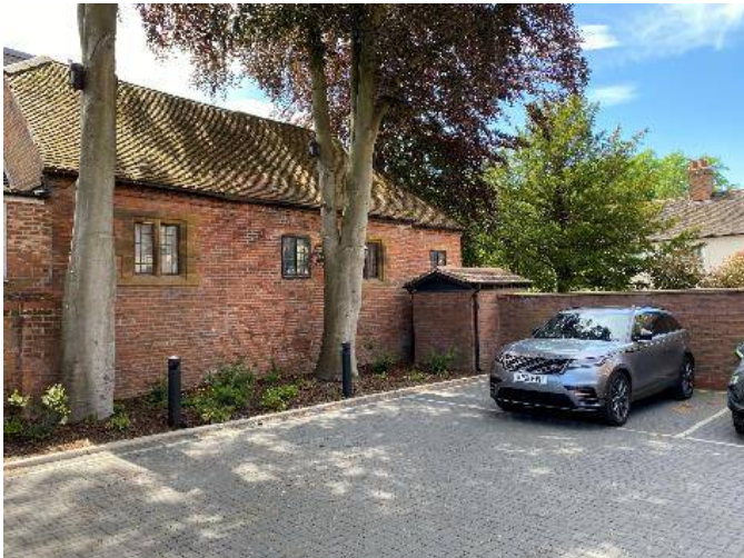
South (facing car parking area and trees)