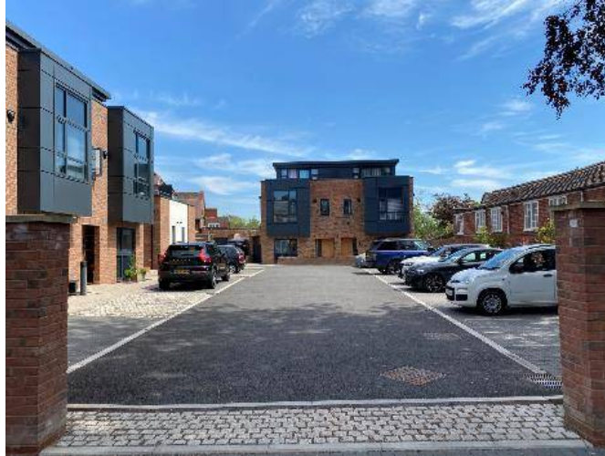
East (facing Abbotsford Mews)