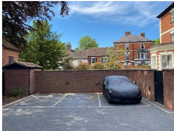
West (facing parking area and garden wall of 1 Abbotsford House)