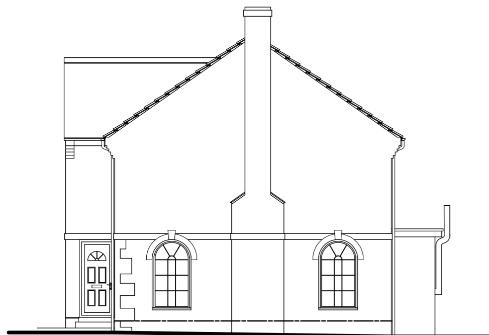
SIDE ELEVATION ASPECT SOUTH