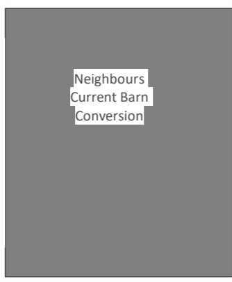
Proposed - Ground Floor Plan 1:100