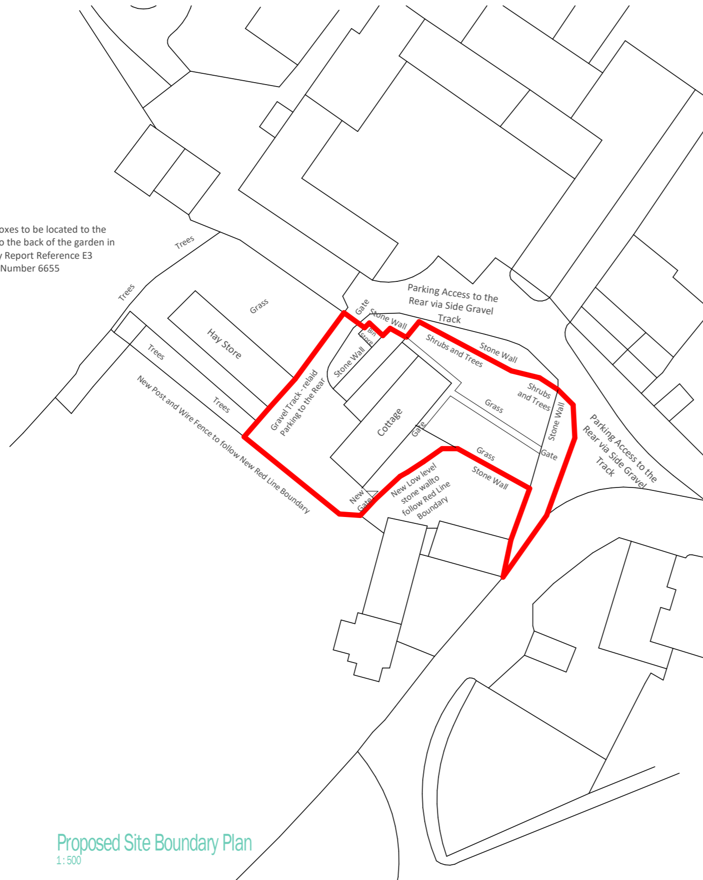
Proposed Site Boundary Plan 1:500

Mitigation Bat Boxes to be located to the Large Ash Tree to the back of the garden in line with Ecology Report Reference E3 Ecology, Project Number 6655