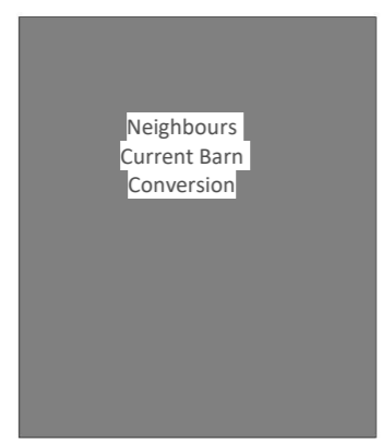
Proposed - First Floor 1:100

Allow for Glazed Infills to Existing Ventilation Slots. *Planners to confirm as slots are very small and likely to be all frame and no glazing* Internally client choice to board over or form openings