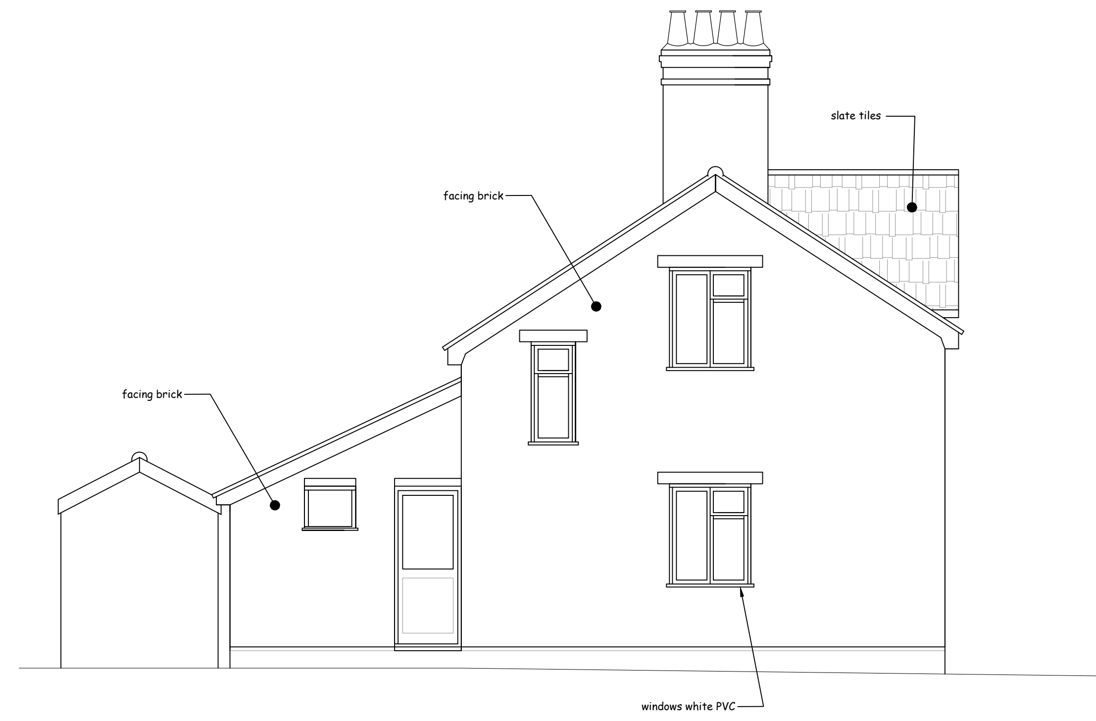
EXISTING SIDE (SOUTH WEST) ELEVATION SCALE 1:50