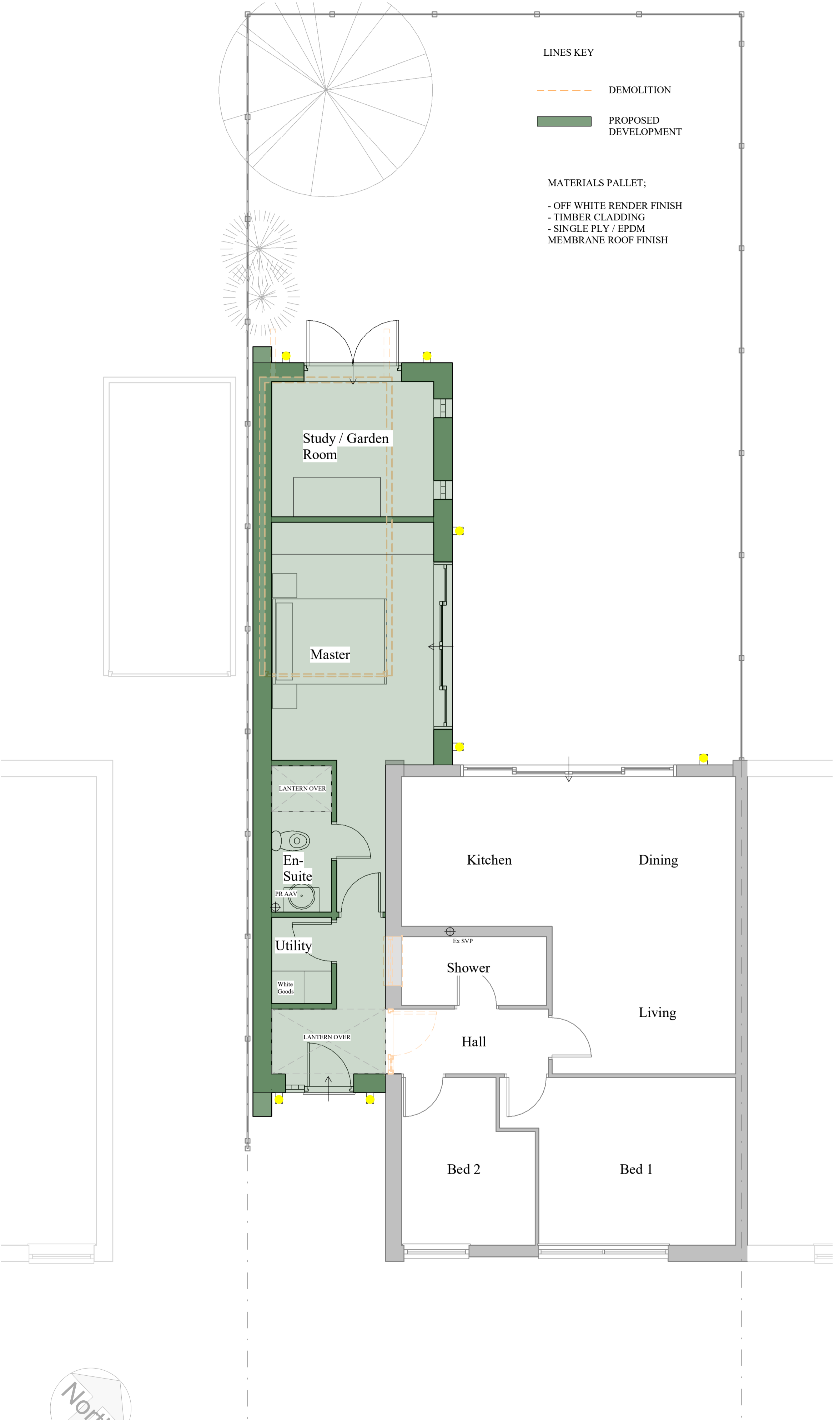
1 Ground Floor 1 : 50