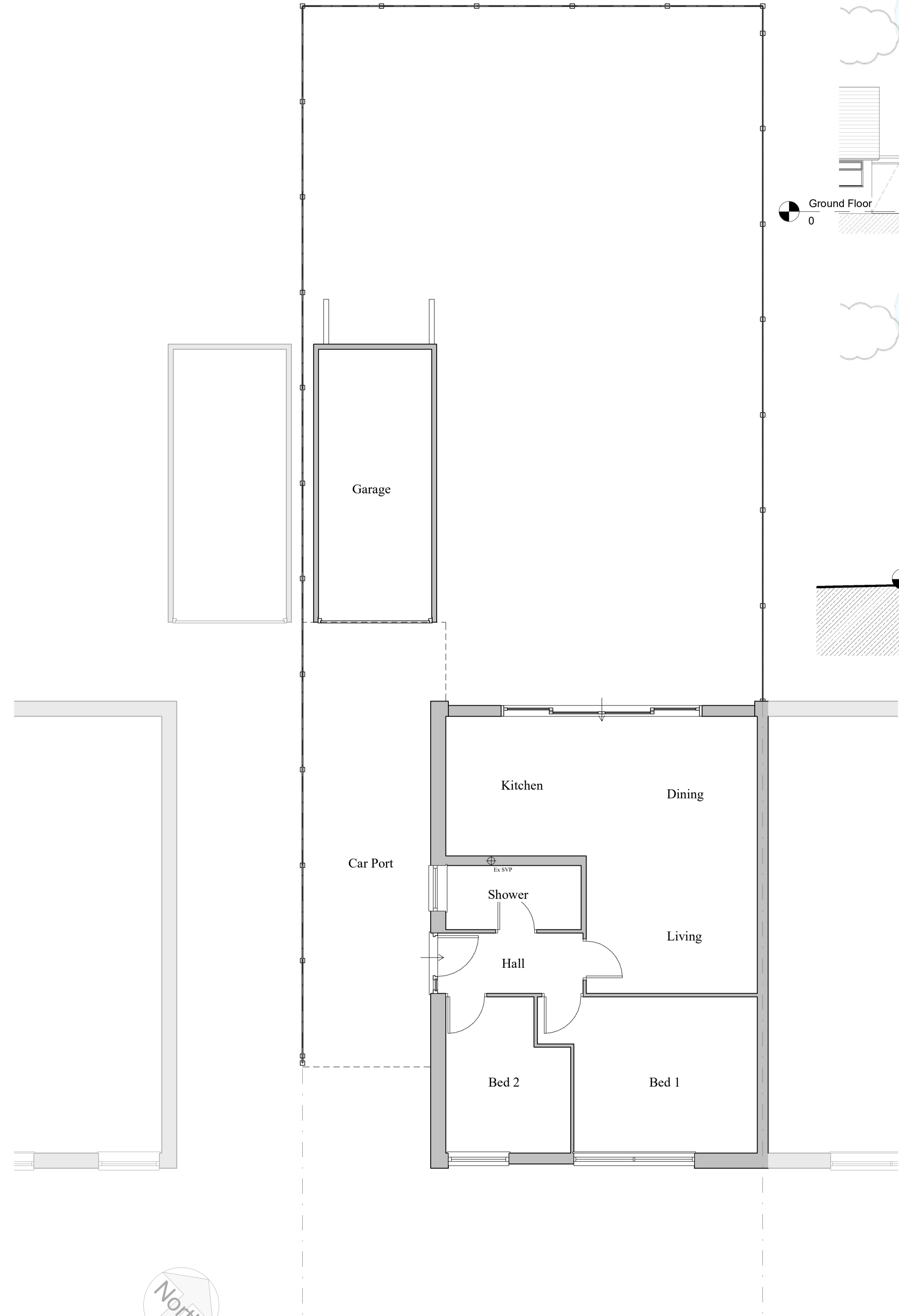
1 Ground Floor 1 : 50