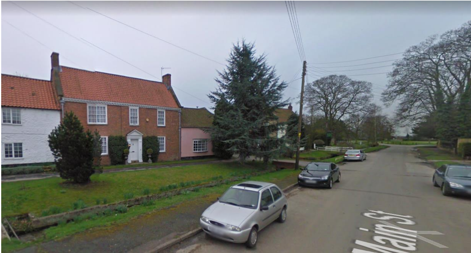
Photograph 1 – View from Main Street