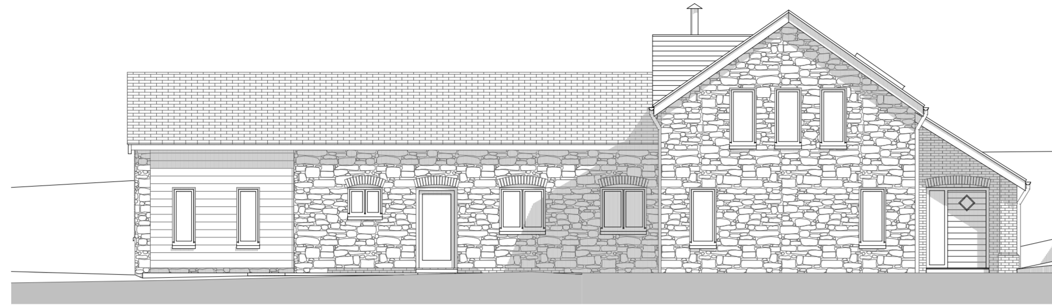
E-01 NORTH 1:100