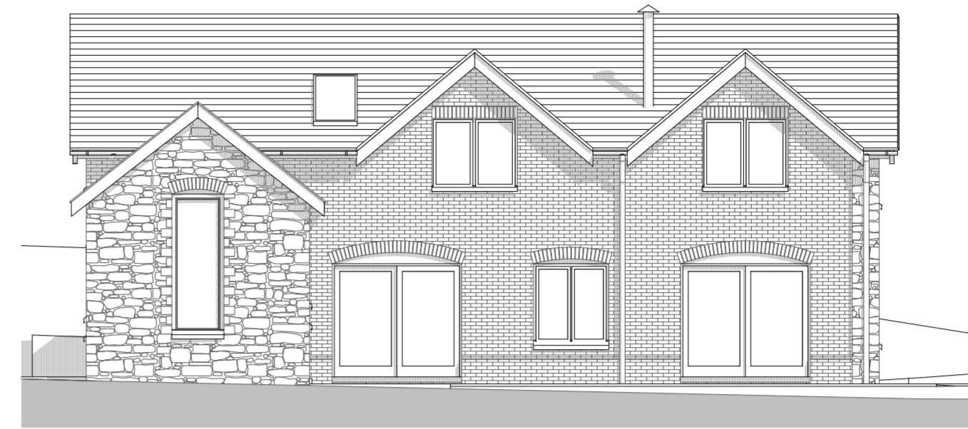
E-02 EAST 1:100