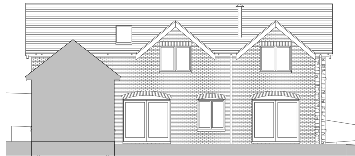
E-05 EAST 1:100