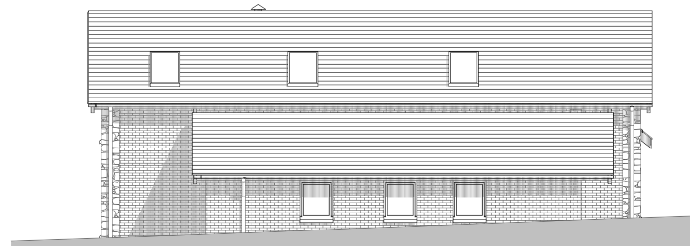
E-04 WEST 1:100

TOTAL FLOOR SPACE FOLLOWING DEVELOPMENT 232m 2