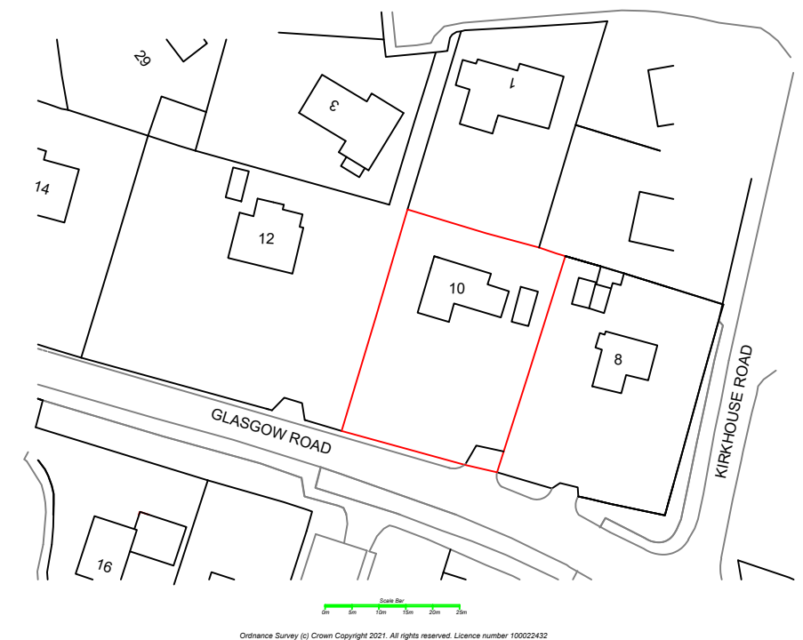
Existing Location Plan 1:1250

kessbear DESIGN 5 kirkhouse crescent blanefield g63 9bu 07984 660551 tish@kessbear.co.uk