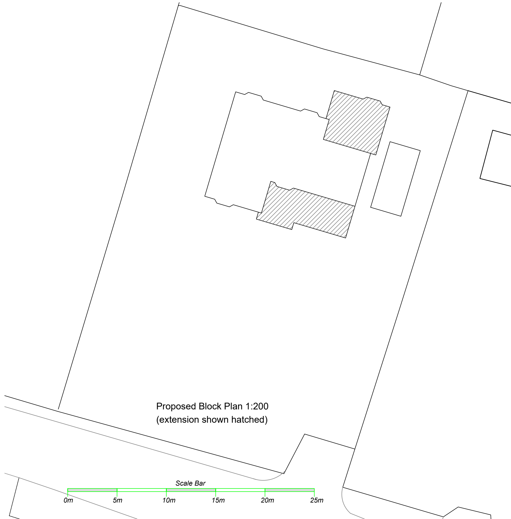
Proposed Block Plan 1:200 (extension shown hatched)