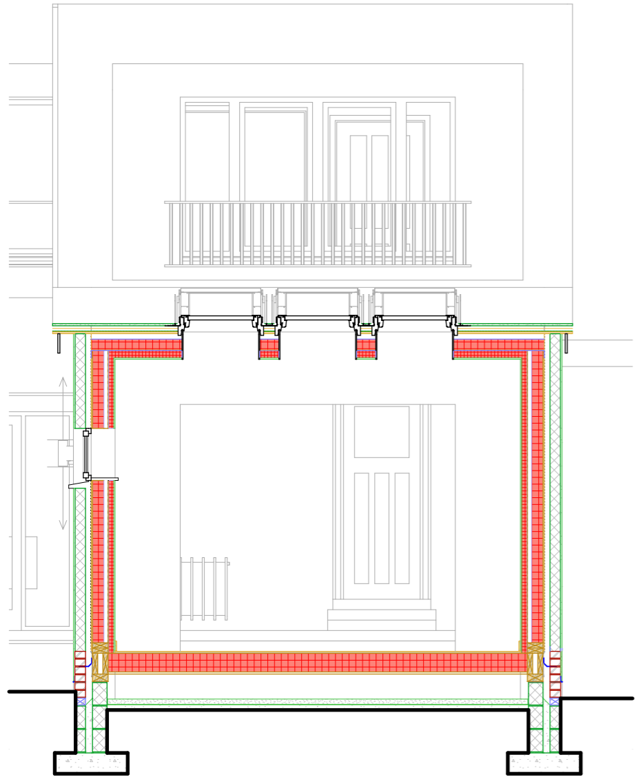
A Section 1:50 0 1 2 3