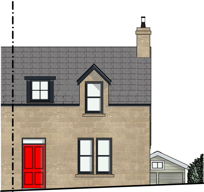
NE Elevation 1:100 01 Existing 0 1 2 3 4 5