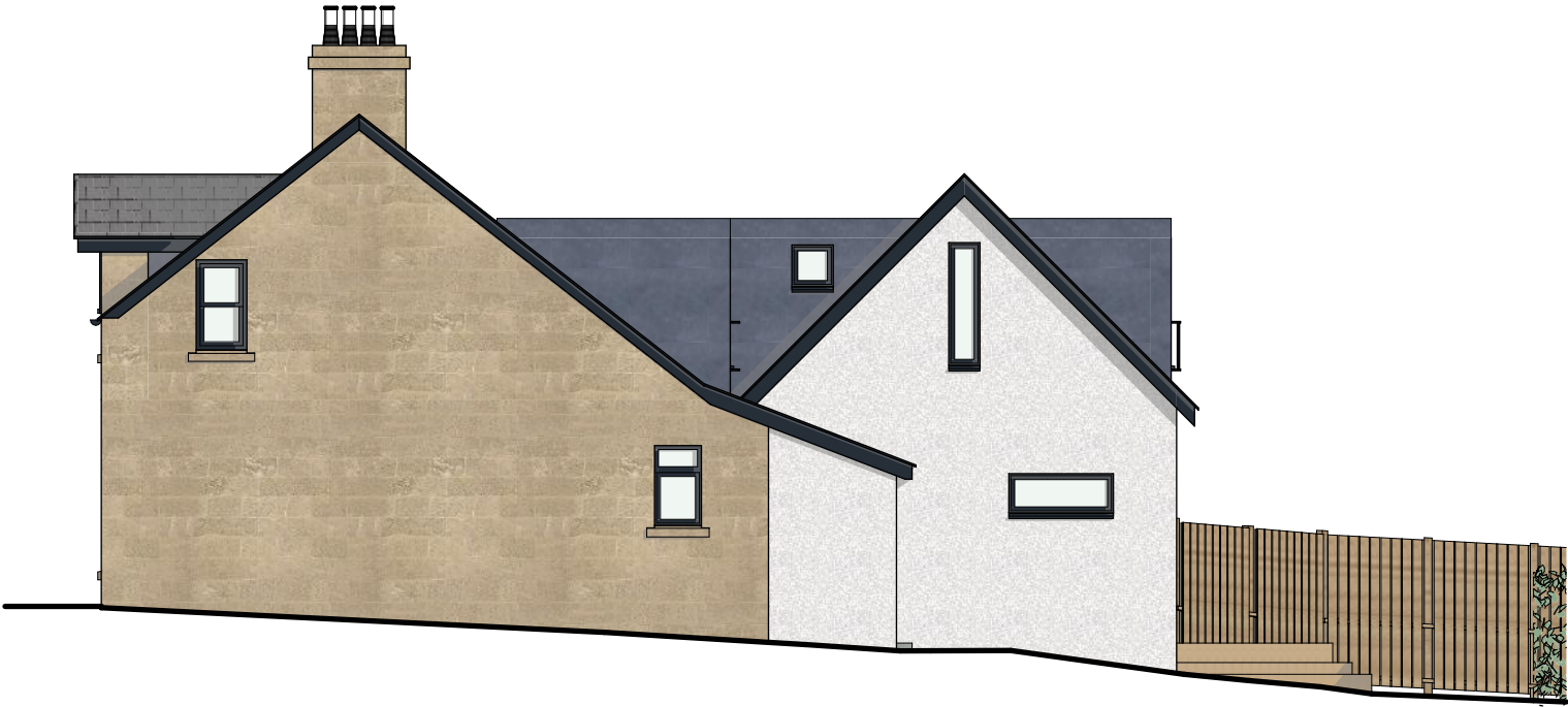
NW Elevation 1:100 01 Existing 0 1 2 3 4 5