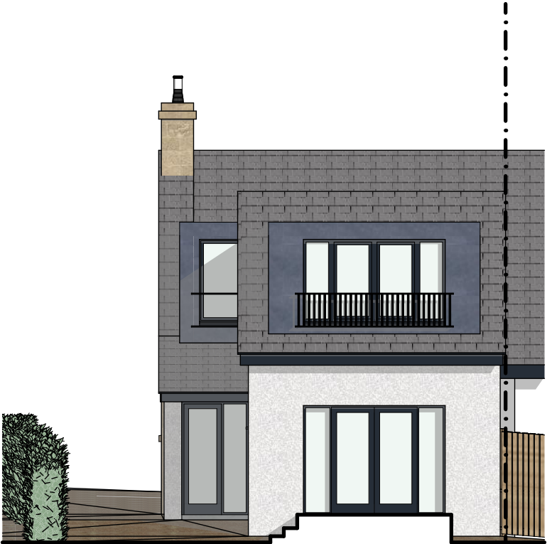
SW Elevation 1:100 01 Existing 0 1 2 3 4 5