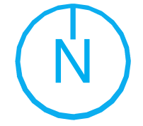
Block Plan as Proposed 1 : 500

EV Charging Provisions Provide ducting and suitable consumer unit to allow the install of one wall charging unit 'Min. 7.4kw' per dwelling when required by householder