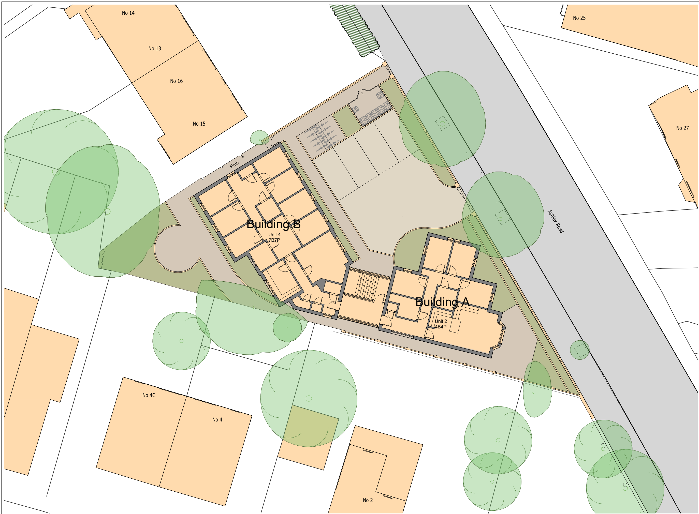
As Proposed Site Plan with First Floor Plan