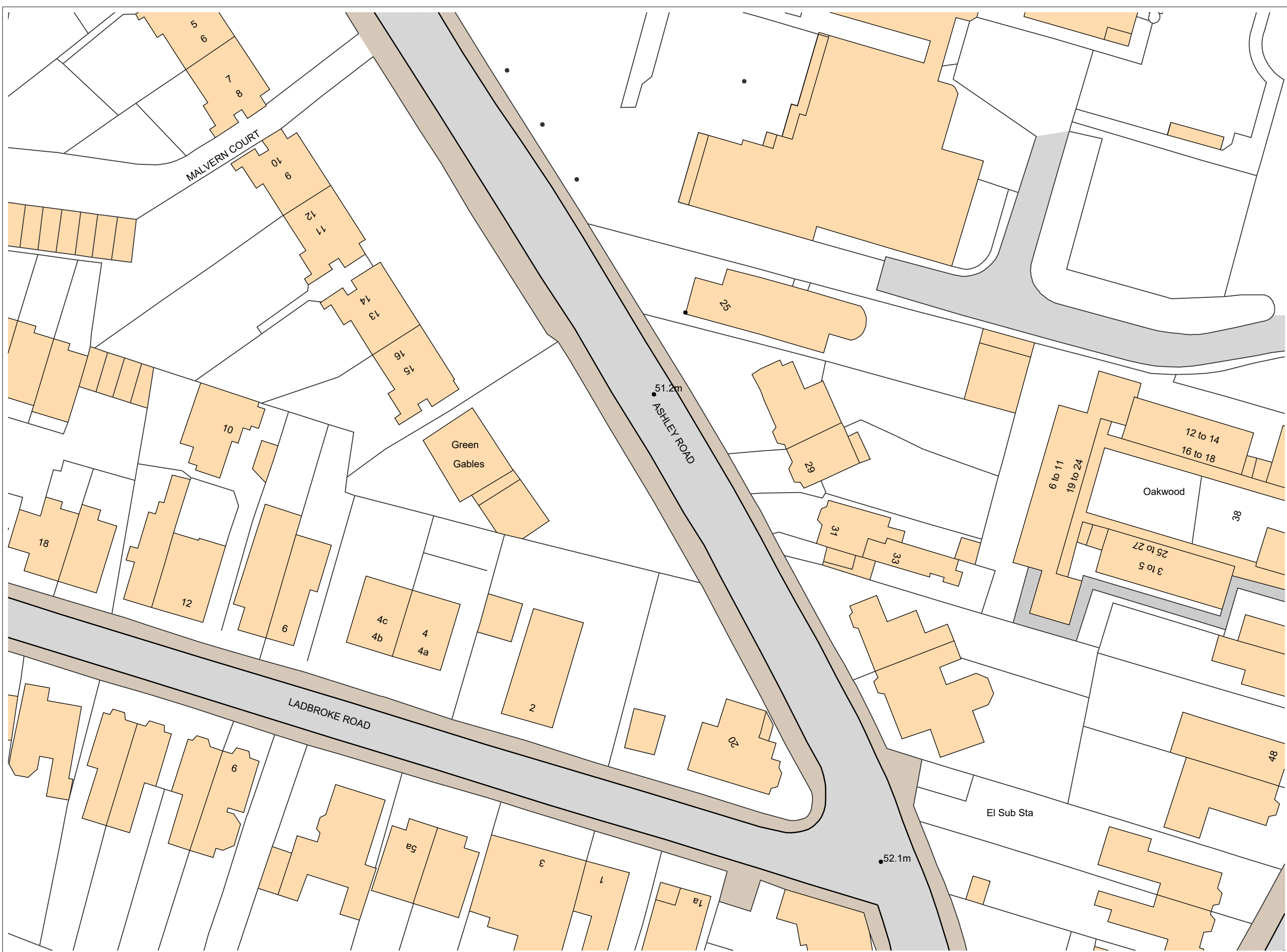
As Existing Site Block Plan