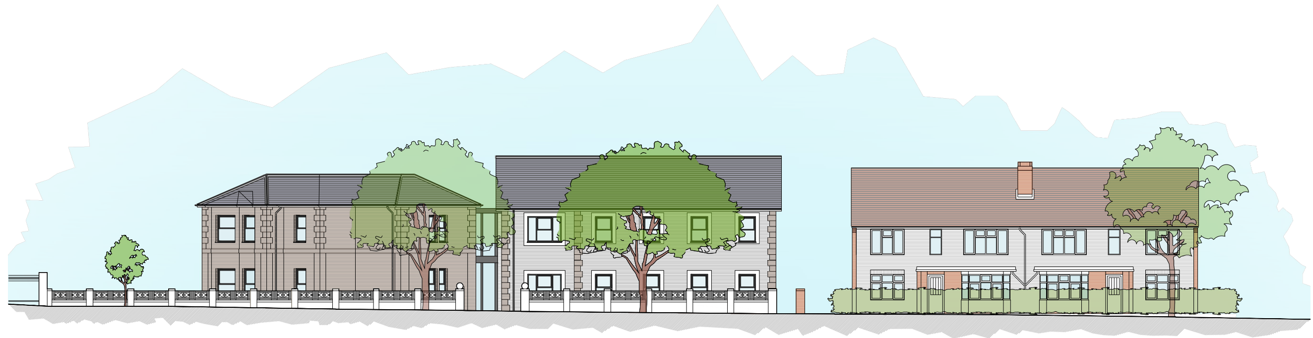
As Proposed Street Scene