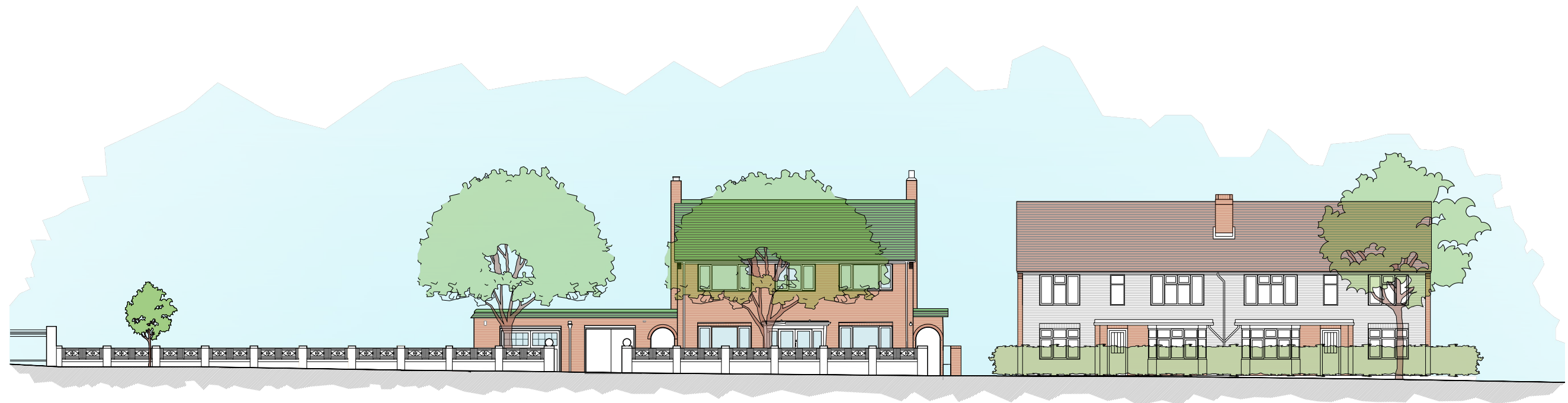
As Existing Street Scene

As Proposed & As Existing Street Scene Ashley Road