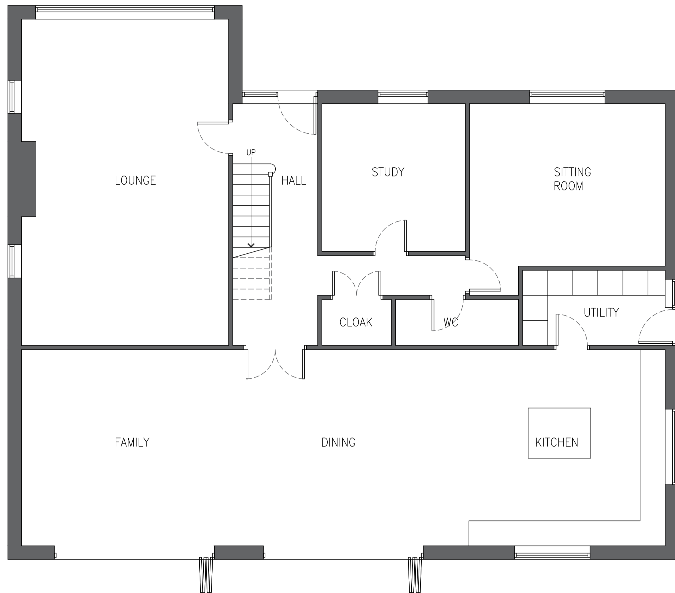
1:50 PROPOSED GROUND FLOOR PLAN