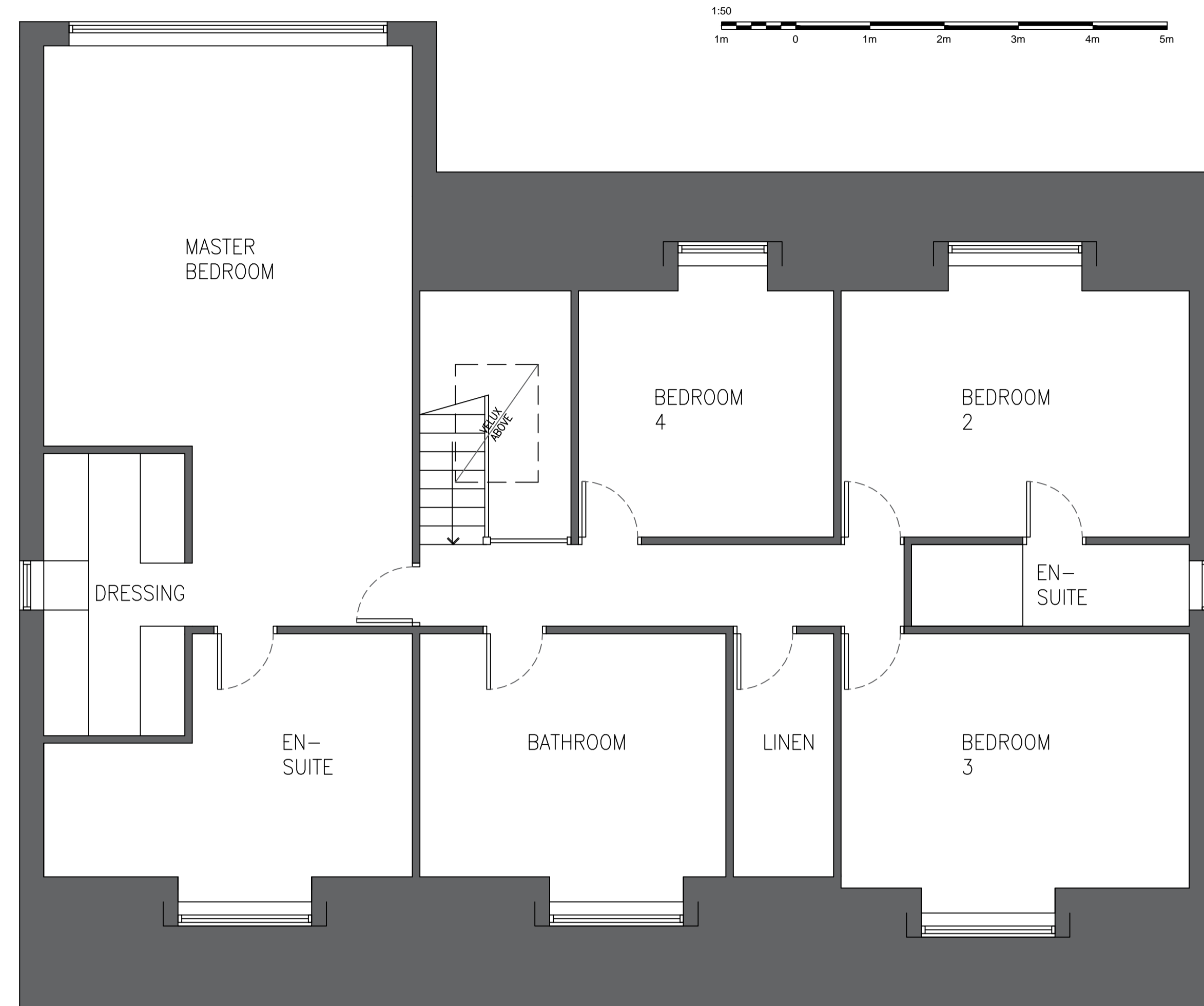
1:50 PROPOSED ATTIC FLOOR PLAN