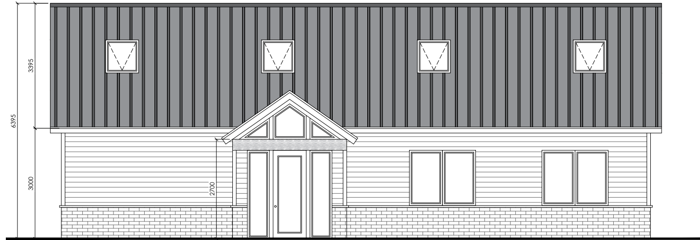
1 FRONT ELEVATION SCALE: 1:100 @ A3