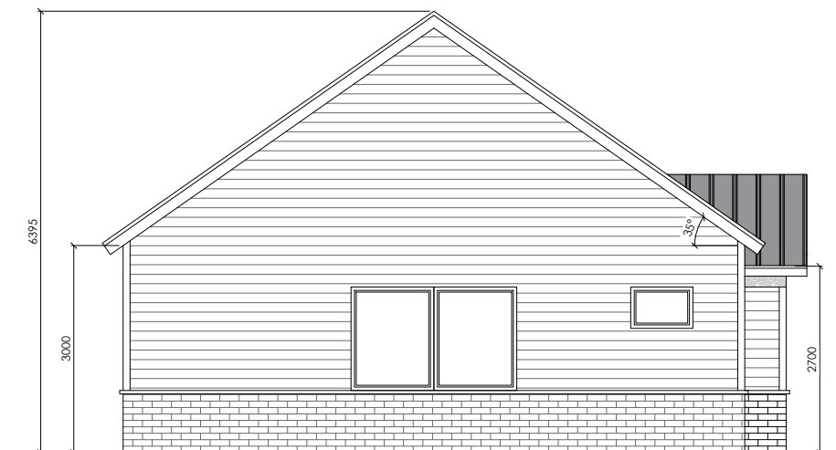
4 LEFT ELEVATION SCALE: 1:100 @ A3