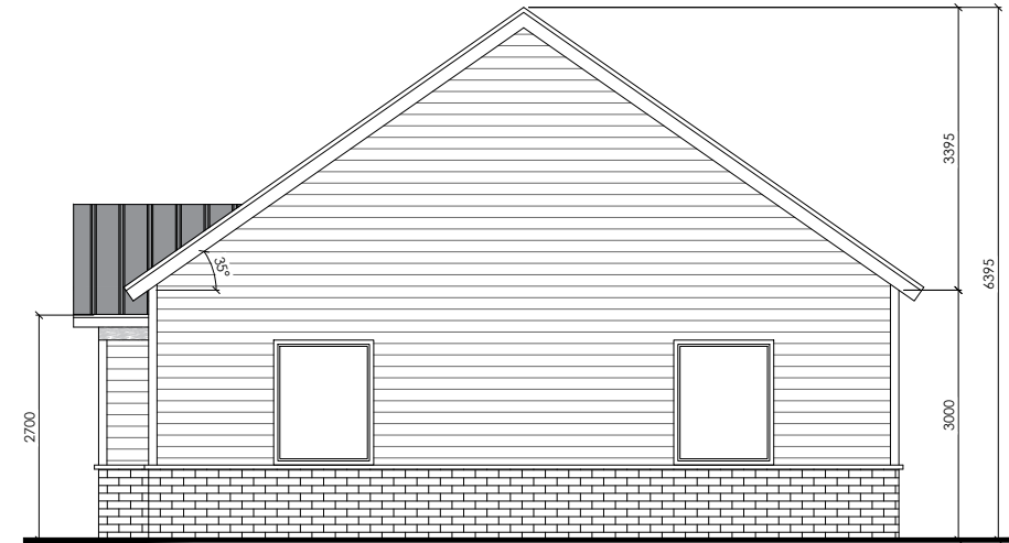
3 RIGHT ELEVATION SCALE: 1:100 @ A3