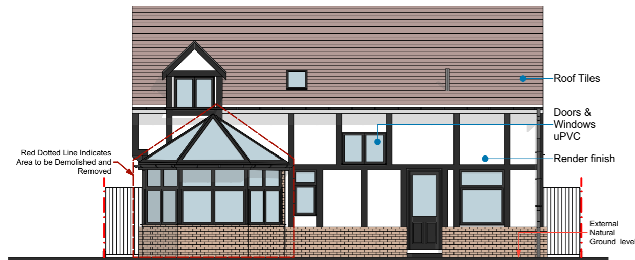
Existing Rear Elevation 1:100