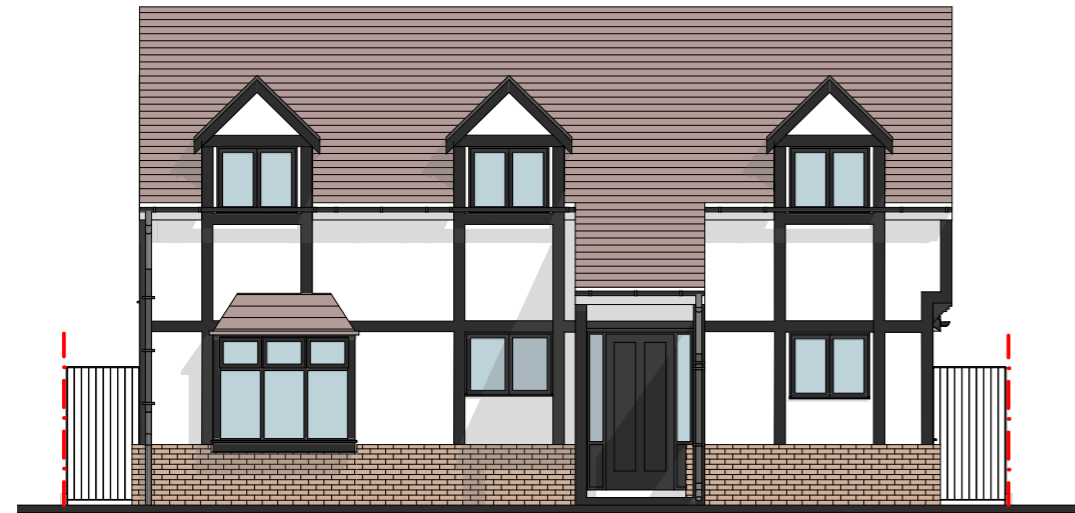
Existing Front Elevation 1:100