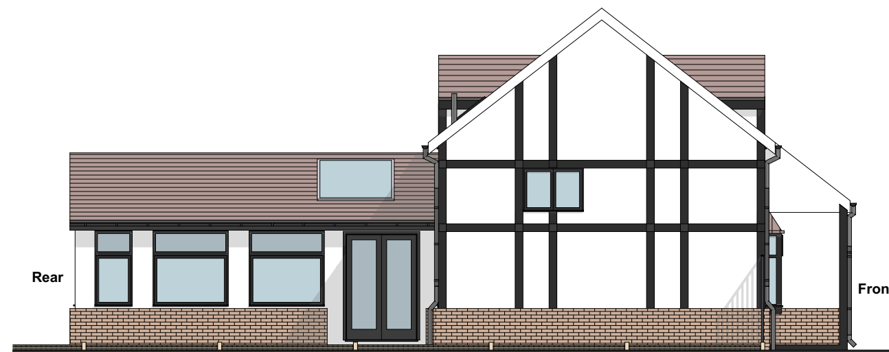
Proposed Side Elevation 1:100