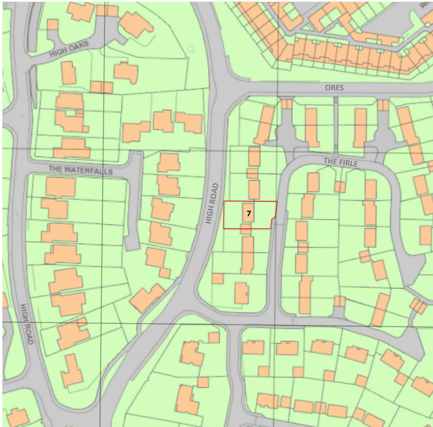
LOCATION MAP scale 1:1250

0 12.5 25 37.5 50 62.5 M Meters @ 1:1250 @ A3