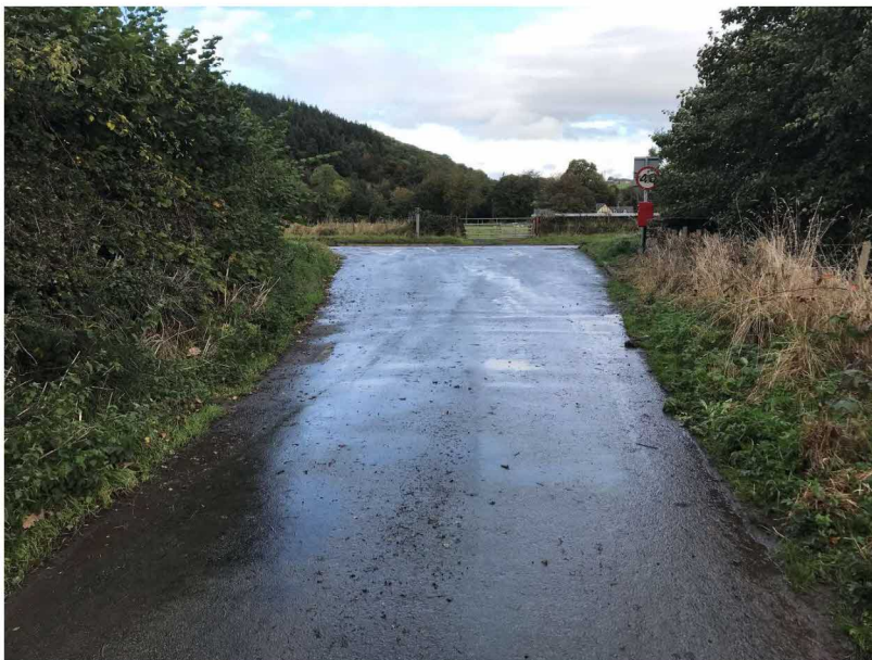
Location 14: Gilfach lane approach to the junction with the A489.