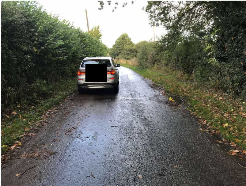
Location 13: widened section of Gilfach Lane.