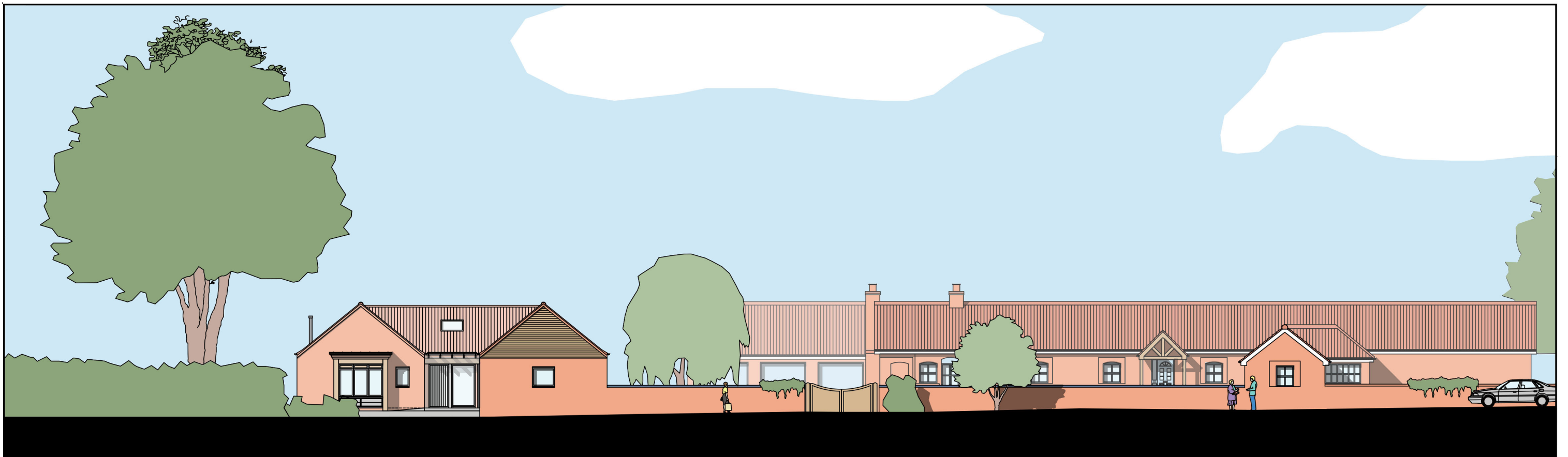
SECTION B - B