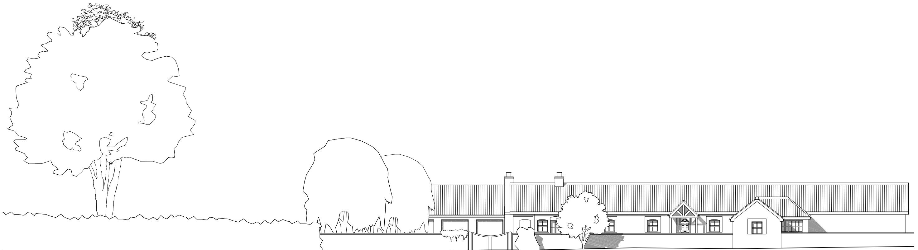
Section B - B