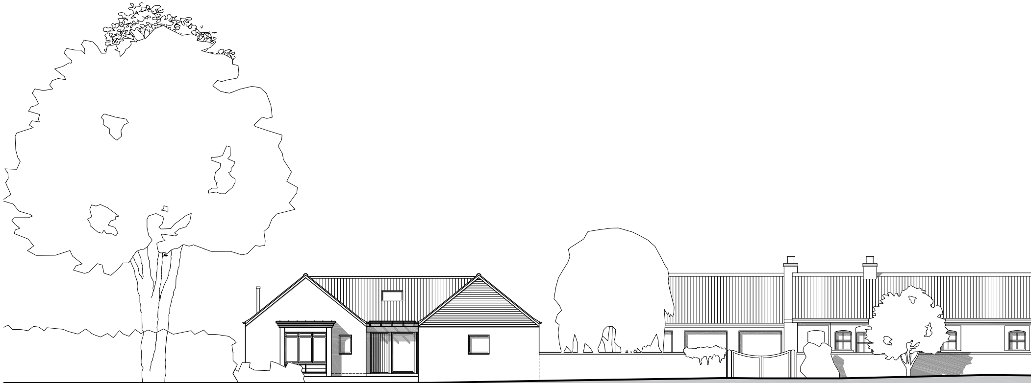
Section B - B